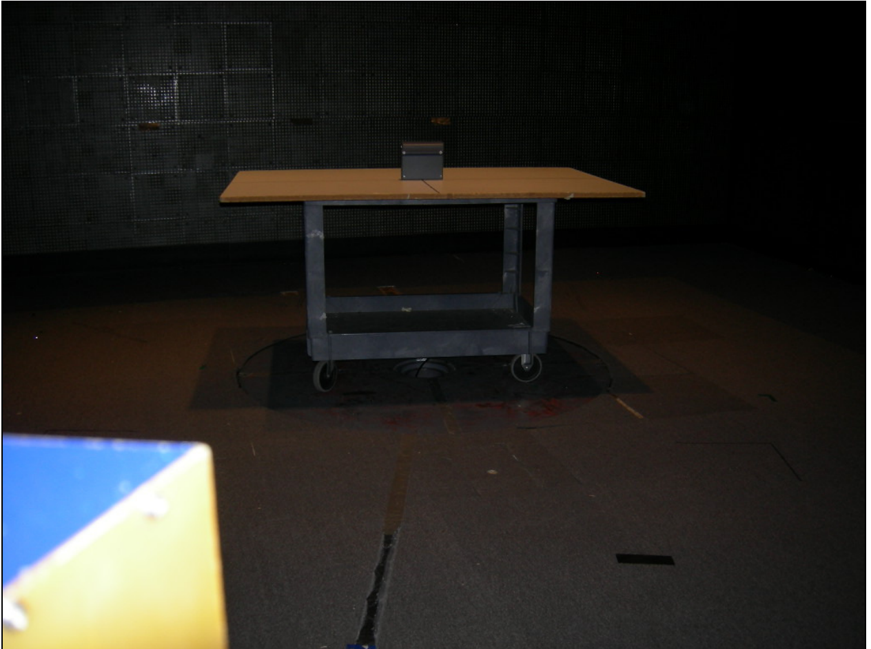
Figure 6: Radiated Emissions – Y Position