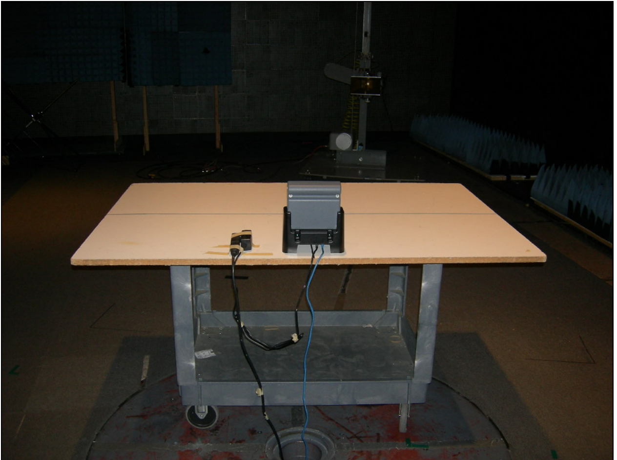
Figure 1: Radiated Emissions – Docked