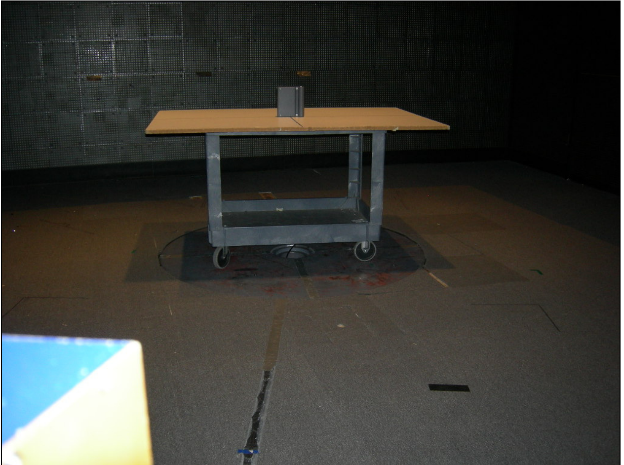
Figure 7: Radiated Emissions – Z Position