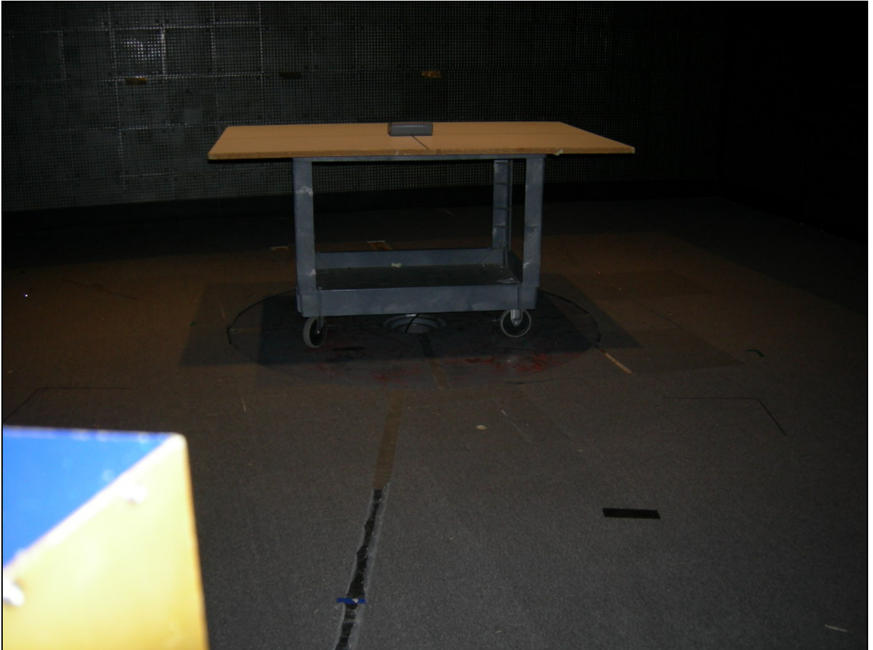
Figure 4: Radiated Emissions – X Position