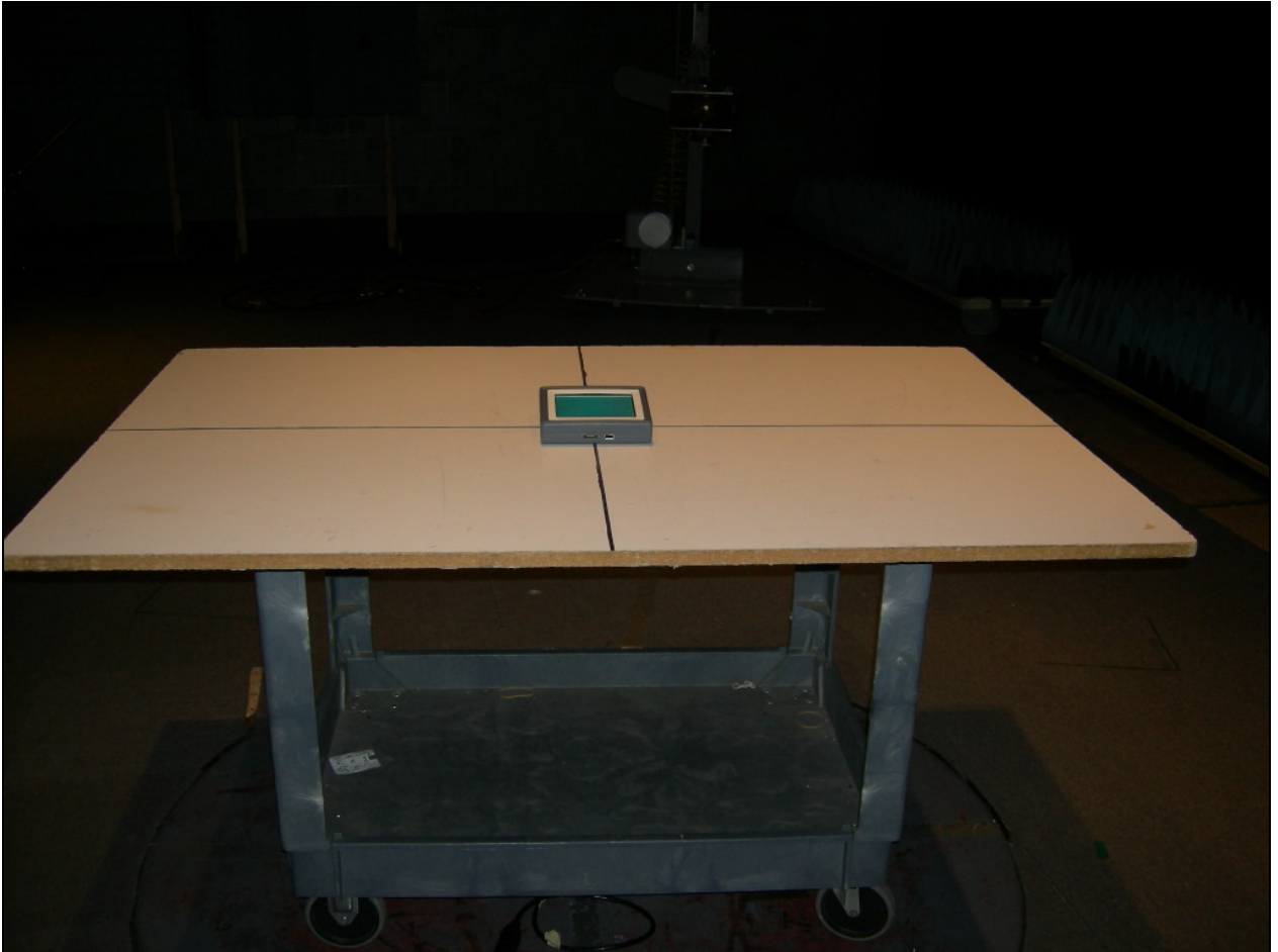
Figure 3: Radiated Emissions – X Position