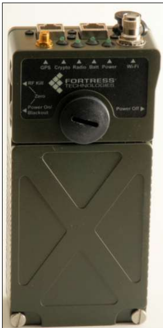
Photograph 1. Fortress Technologies, Inc. ES210

The ES210 is intended to provide outdoor connectivity in a secure manner both wired and wirelessly. It can operate with either AC power or by a battery.