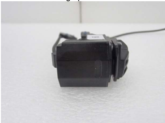
Photograph A5: Front