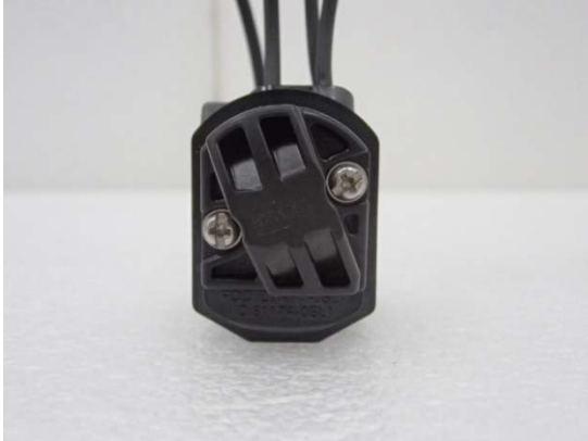
Photograph A1: Top