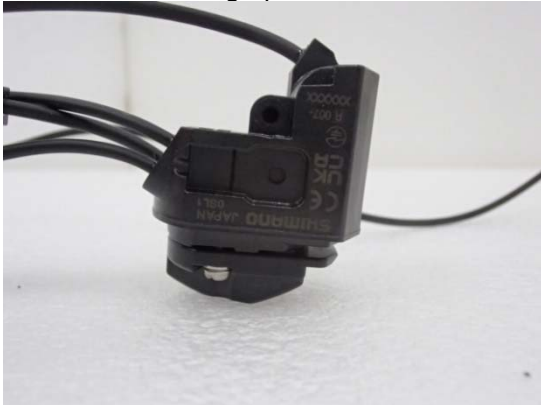
Photograph A3: Left