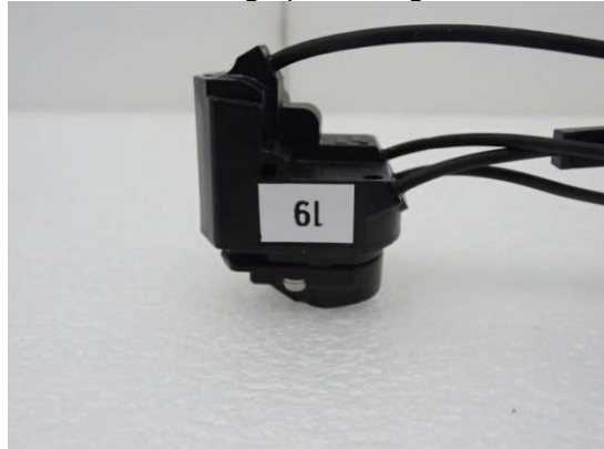
Photograph A4: Right