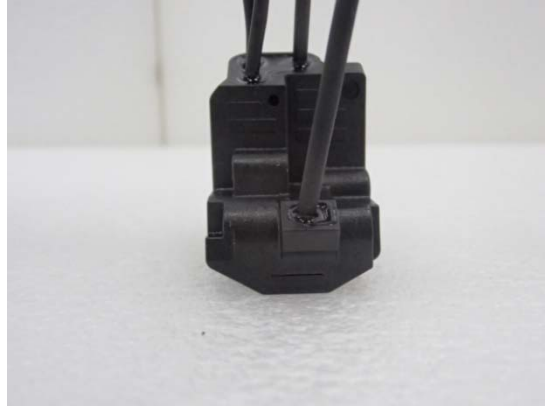
Photograph A2: Bottom