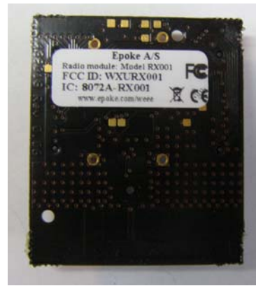
RX001 back side (visible when mounted)