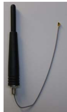
3) Antenna with fixed UFL connector