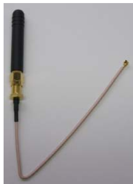
2) Antenna with RPSMA connector and cable