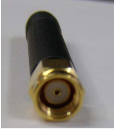
Reverse polarity SMA connector (antenna 2)