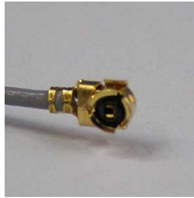
UFL connector (antenna 3)