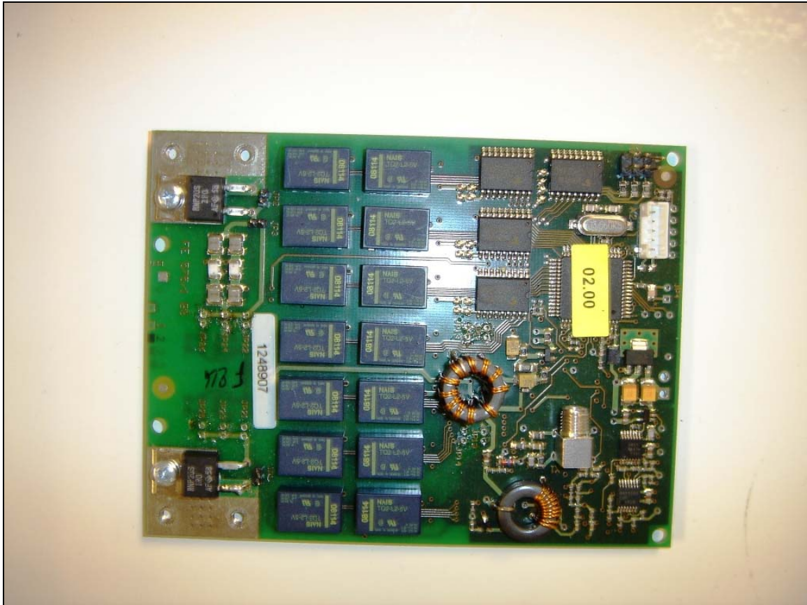
Photograph 4. DAT Board