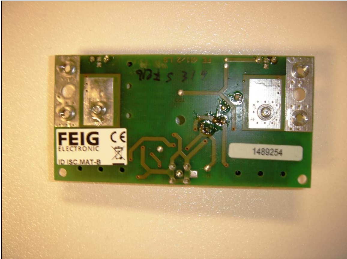
Photograph 2. MAT Board