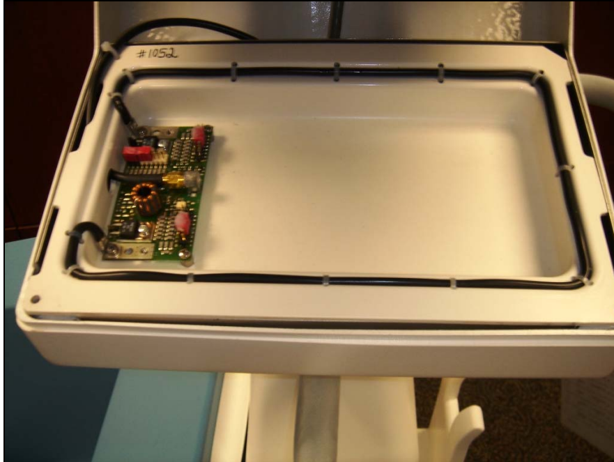
Photograph 5. InScan Antenna