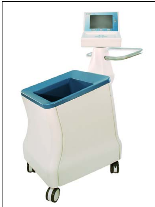
Photograph 2. Device with Panels