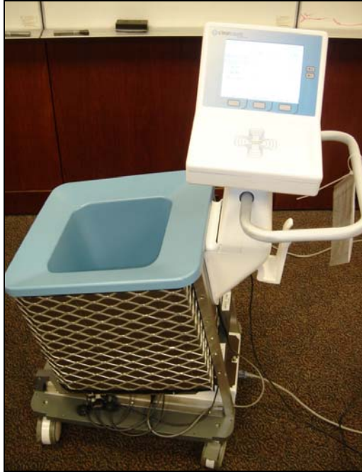
Photograph 1. Device no Panels