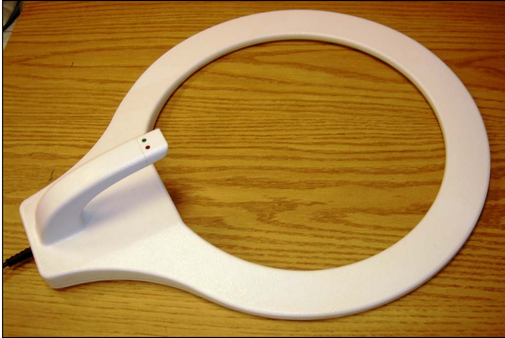
Photograph 7. Wand