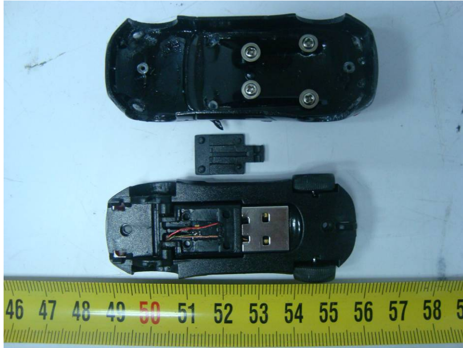
EUT – Cover off View 2