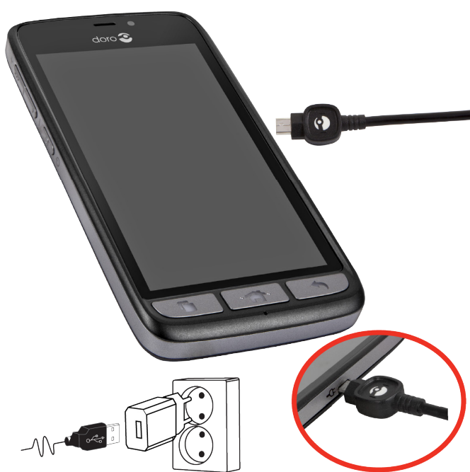
EN: Charge the phone