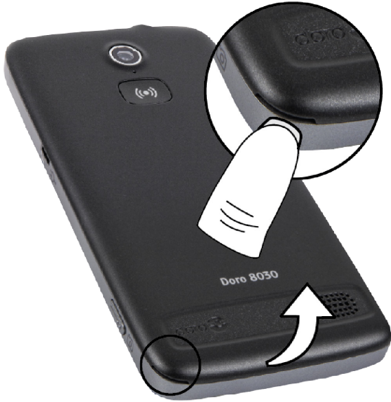
EN: Remove battery cover