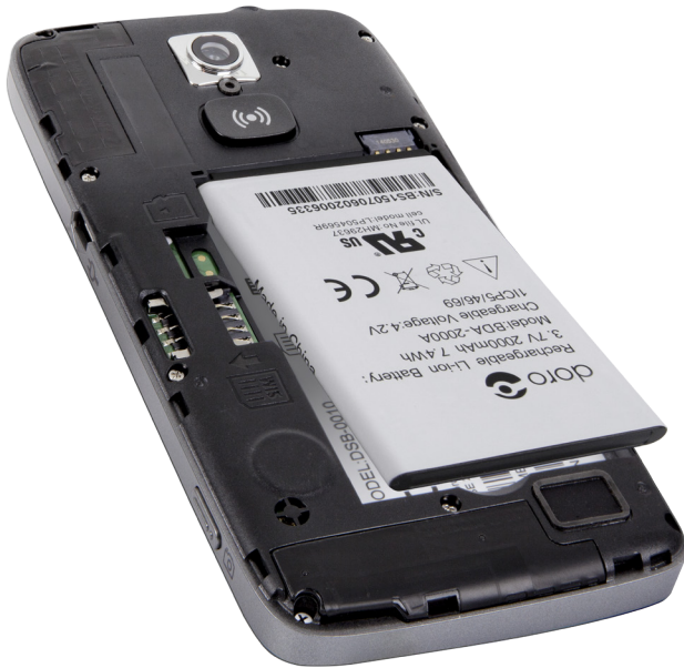
EN: Insert the battery and replace the battery cover