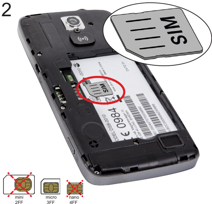
EN: Insert SIM card (not included)

EN: For the full manual please visit www.doro.se/support/search/ or contact our Helpline.