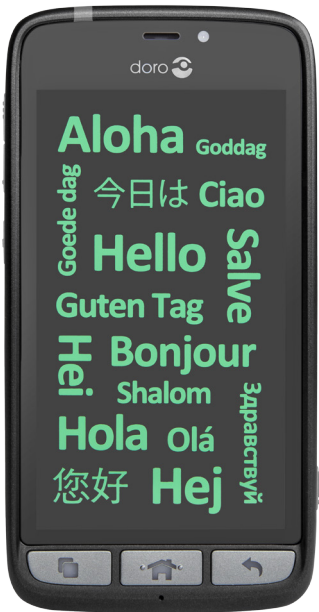
EN: Follow the instructions in the setup assistant to activate your device and set it up.