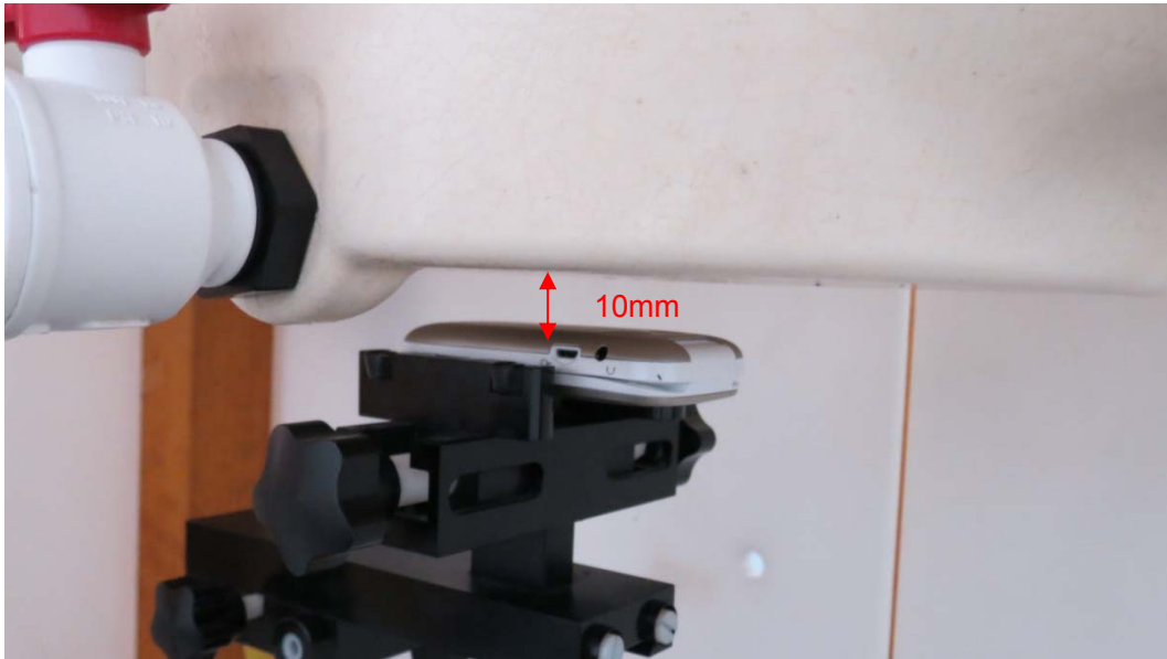
Picture 10: Back Side with closed clamshell, the distance from handset to the bottom of the Phantom is 10mm