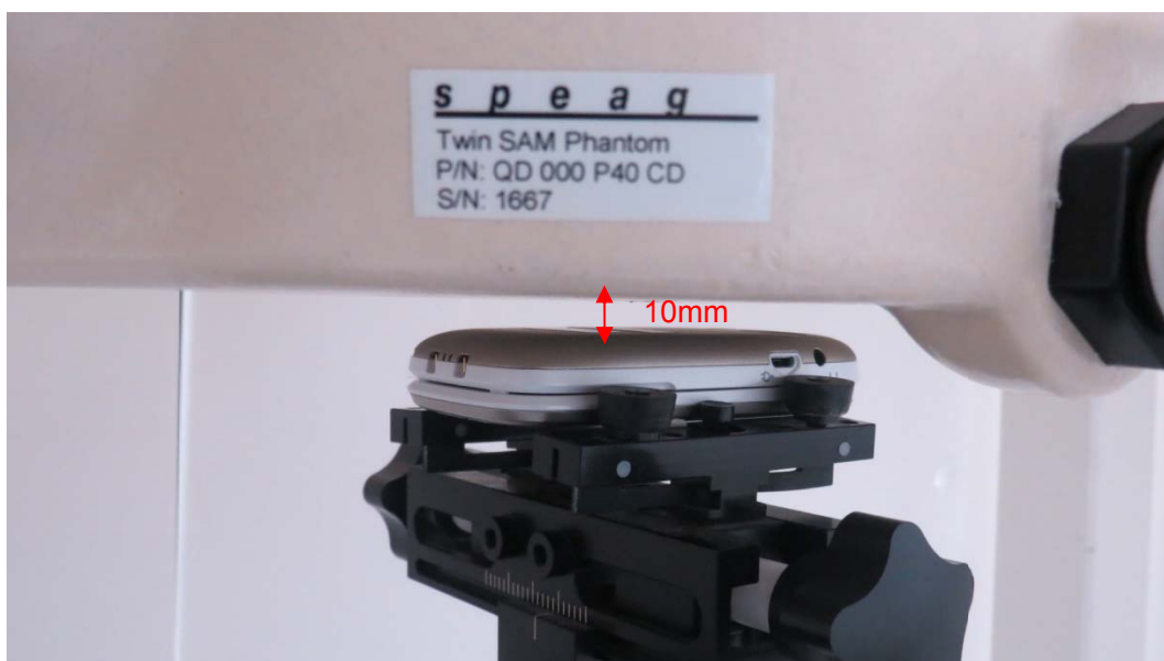
Picture 11: Front Side with closed clamshell, the distance from handset to the bottom of the Phantom is 10mm