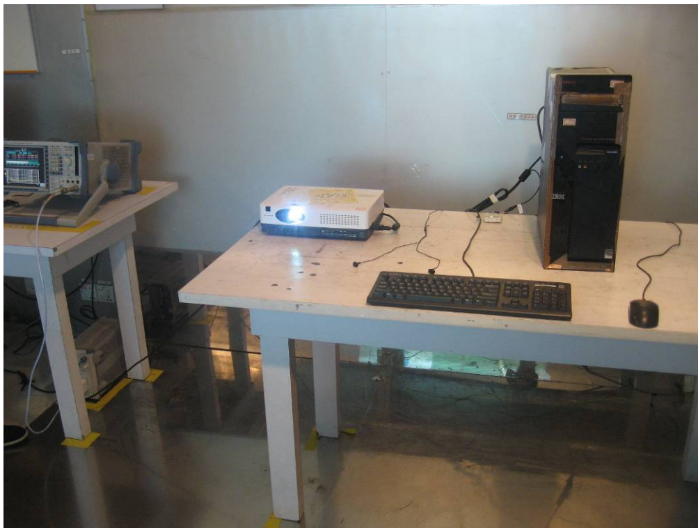
TEST SETUP OF CONDUCTED EMISSION