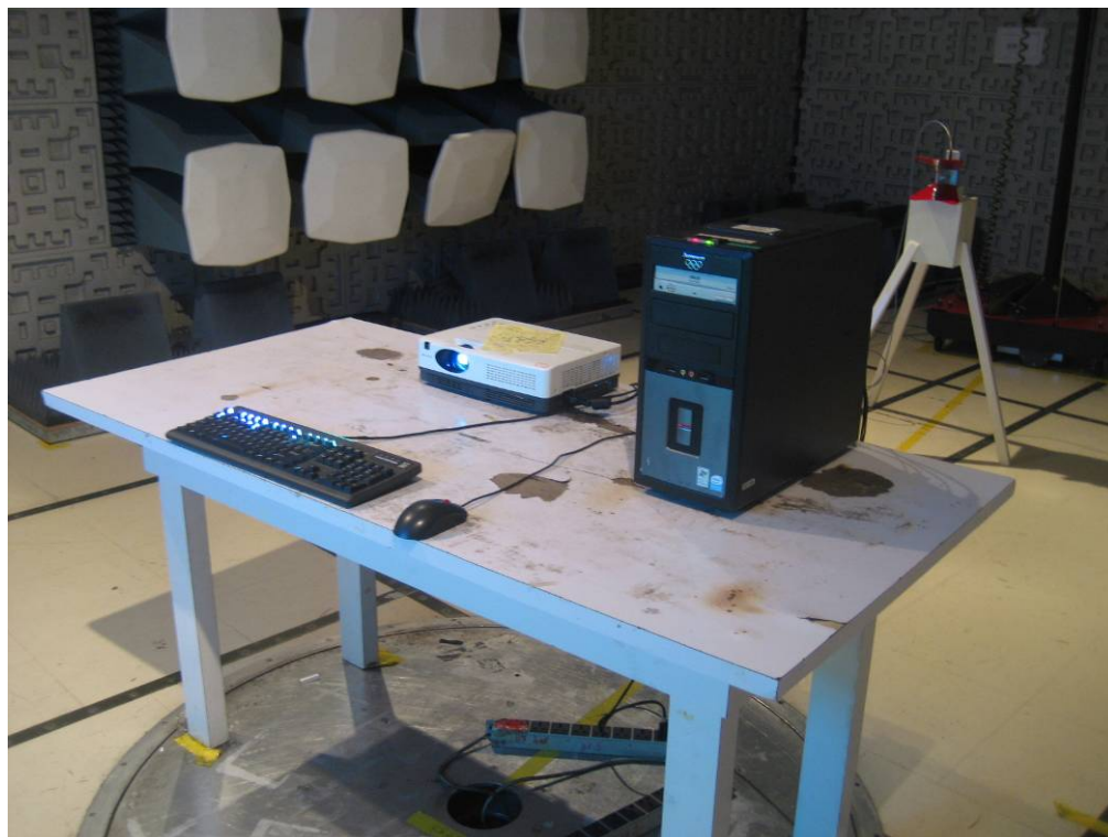
TEST SETUP OF RADIATED EMISSION (ABOVE 1 GHZ)