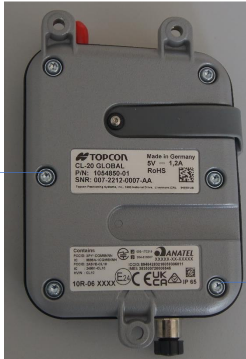
Compliance label (example)