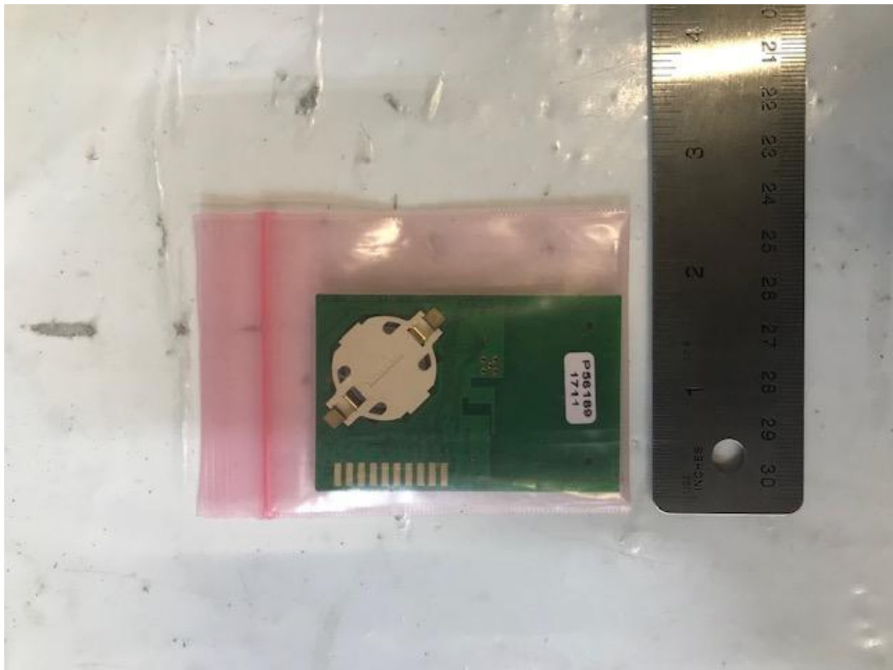
Figure 2. EUT with Label Paper Removed (Back)

FCC Part 15 Certification/ RSS 210 WPEUWL02G 8031A-UWL02G 19-0170 May 21, 2019 PakSense, Inc. UWL02G