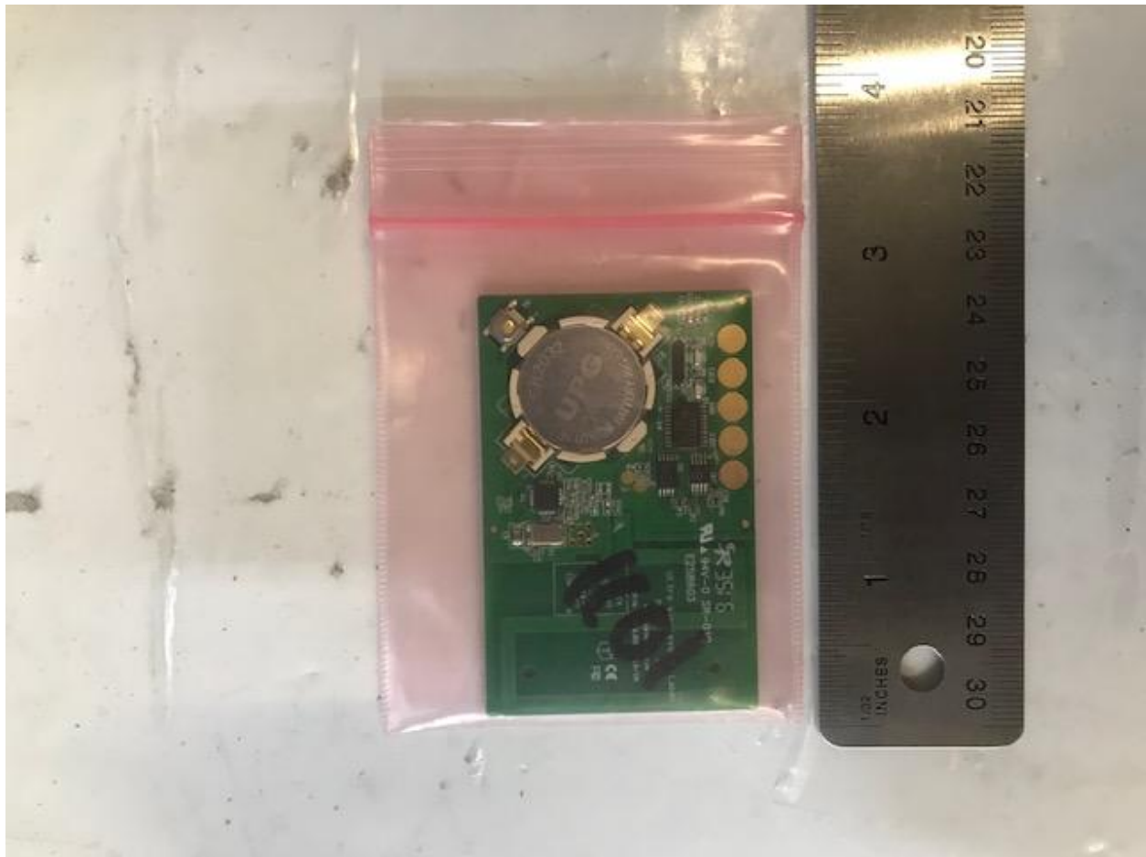
Figure 1. EUT with Label Paper Removed (Front)