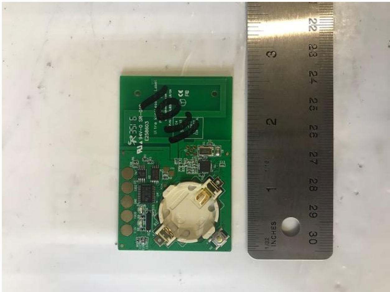
Figure 4. EUT Front with Battery Removed

FCC Part 15 Certification/ RSS 210 WPEUWL02G 8031A-UWL02G 19-0170 May 21, 2019 PakSense, Inc. UWL02G