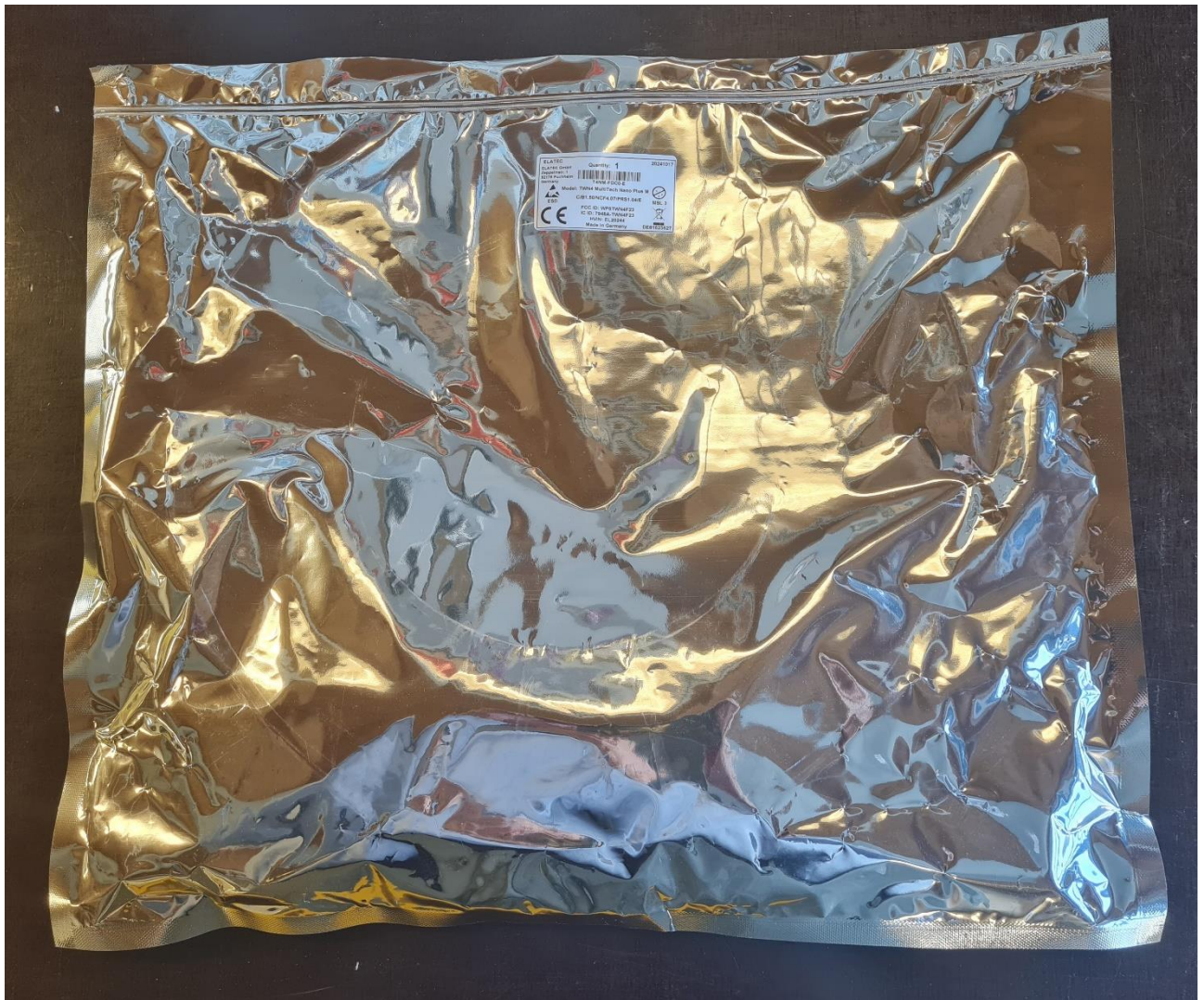
Picture 1: Label Location – label is placed on the packaging due to the size of the module