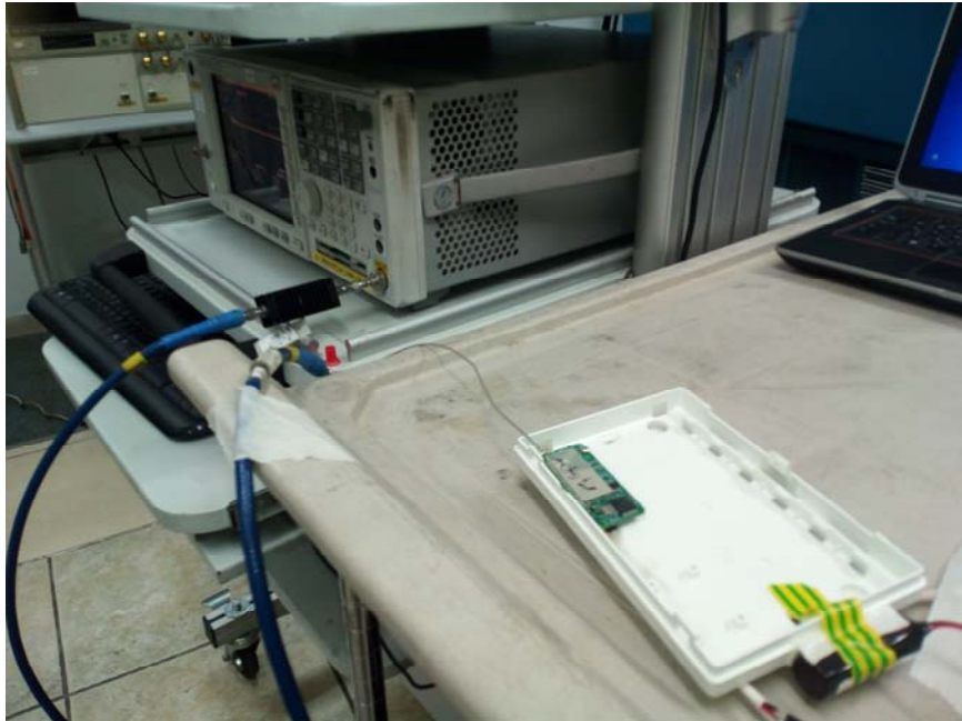
Photograph No.1 Setup for output power, OBW and hopping parameters measurements