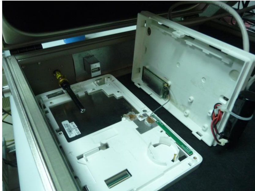
Photograph No.1 Setup for OBW measurements