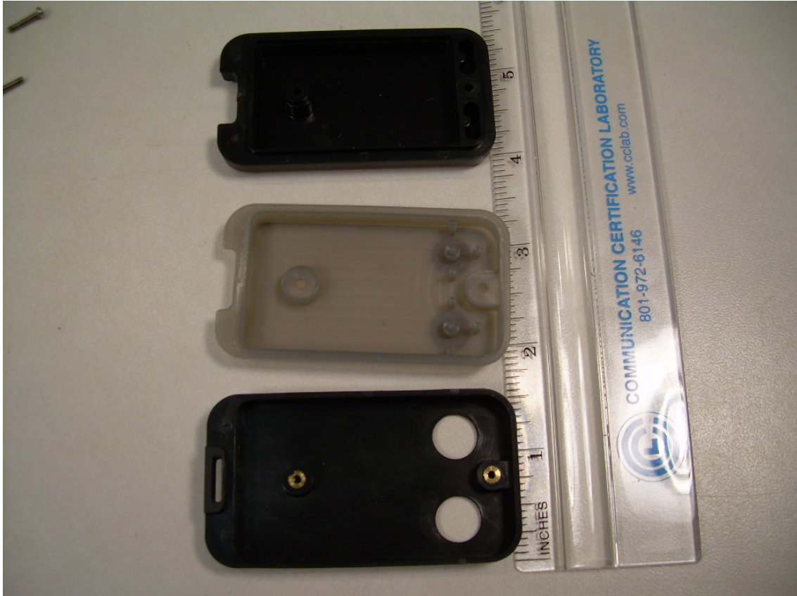
View of the EUT Key FOB Housing