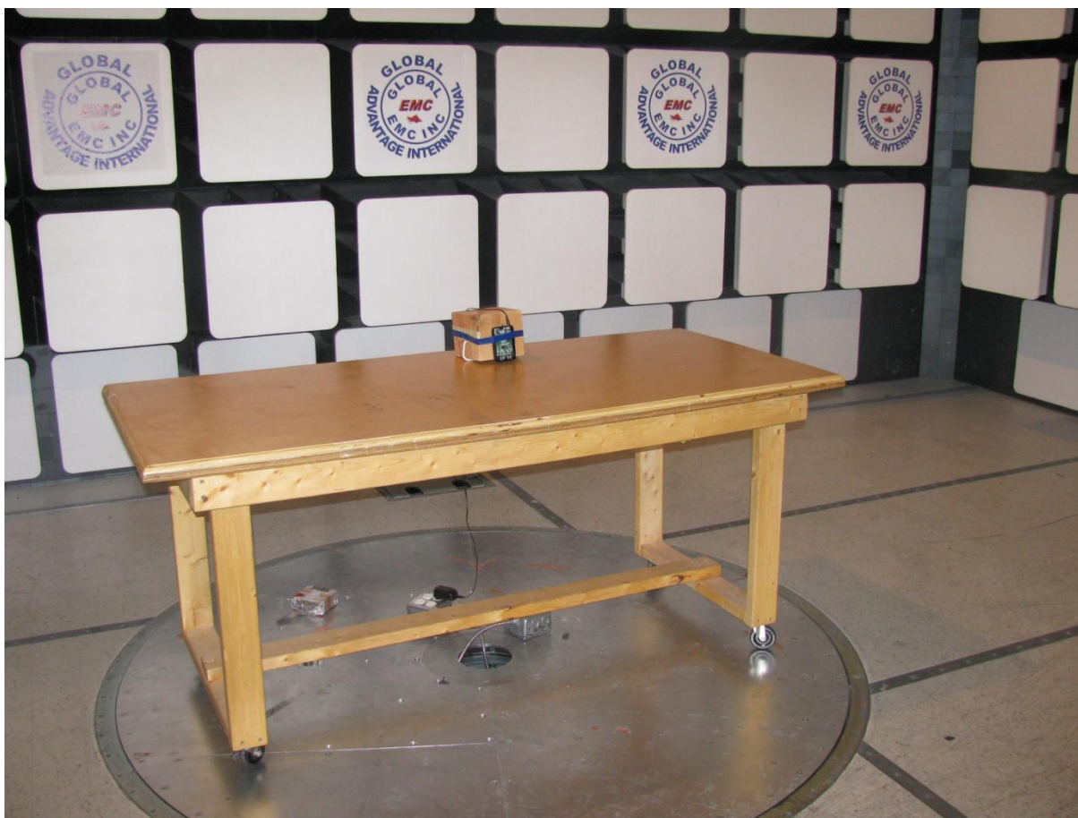
Figure 1 – Radiated emission setup