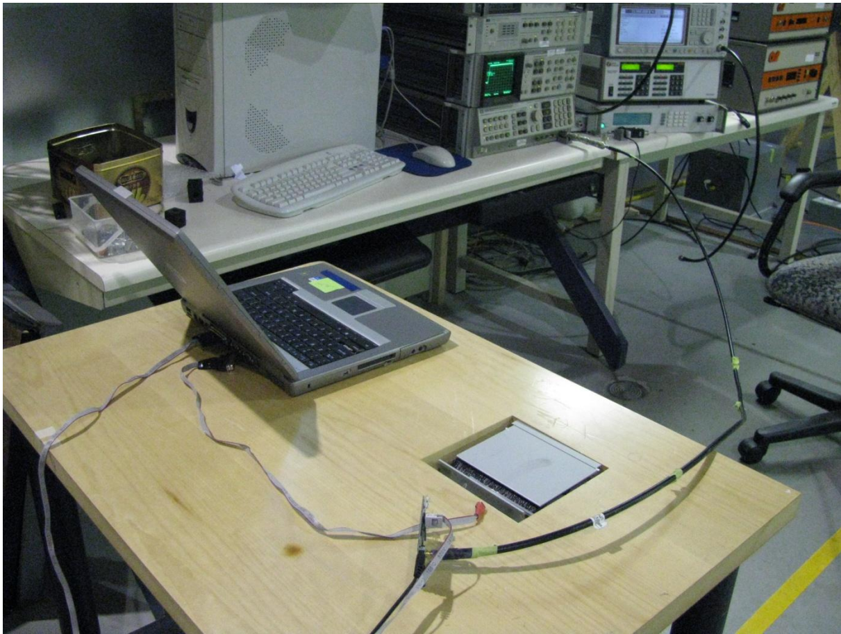
Figure 3 – Conducted power emissions