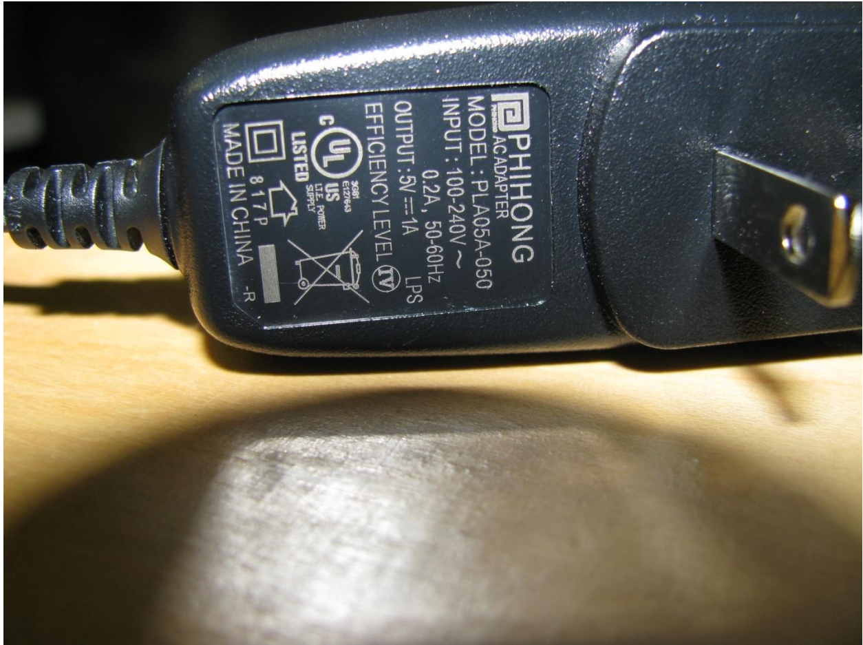
Figure 4 – AC mains power adaptor