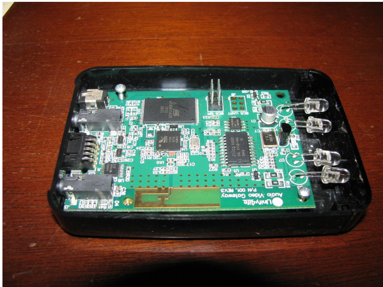
Figure 1 – Top side of board