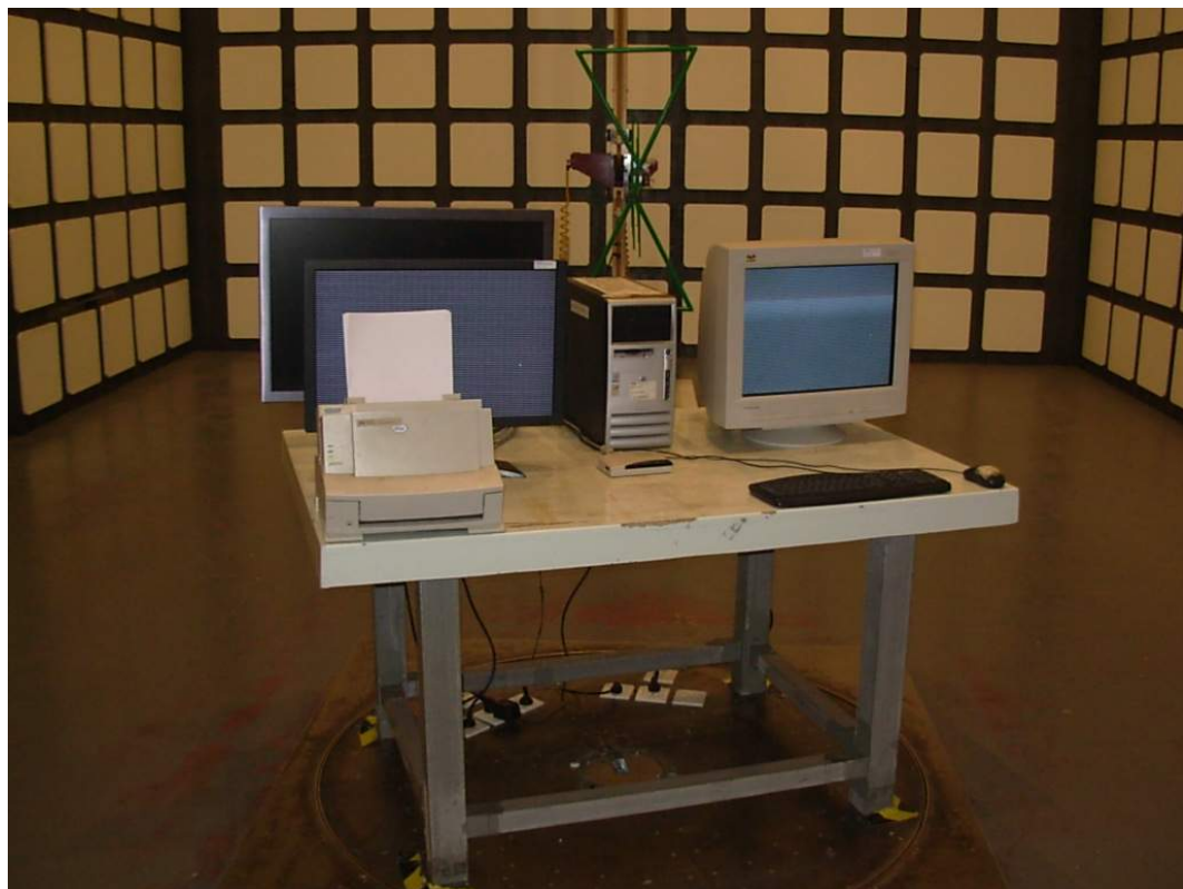
SETUP WITH MAXIMUM DETECTED EMISSION AT VERTICAL POLARIZATION (CRT+HDMI 2048*1536@75Hz)