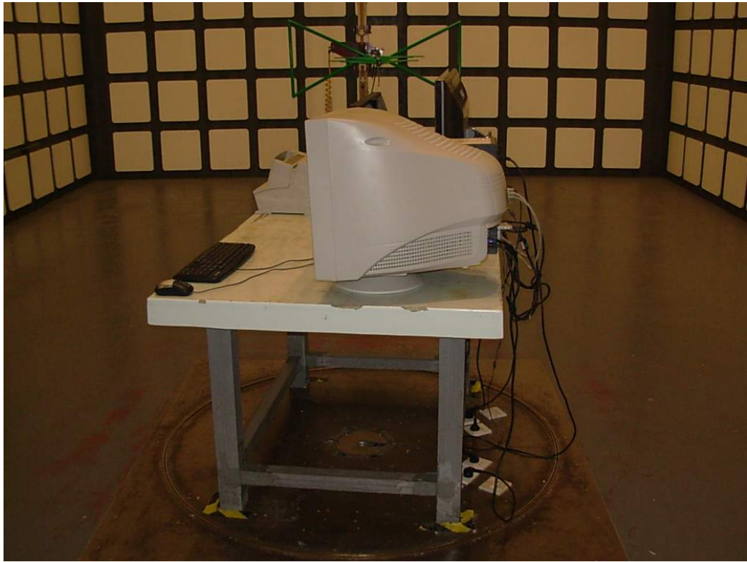
SETUP WITH MAXIMUM DETECTED EMISSION AT HORIZONTAL POLARIZATION (CRT+HDMI 2048*1536@75Hz)