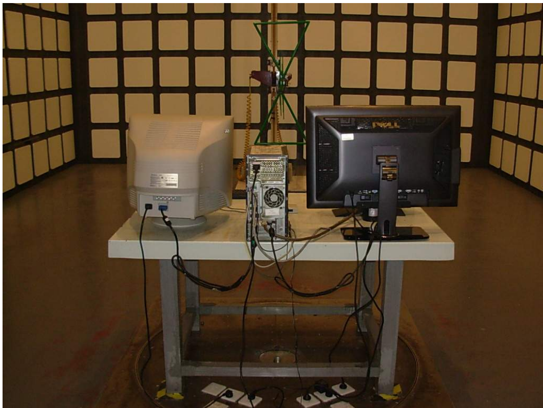
BACK VIEW OF RADIATED EMISSION TEST (BELOW 1GHz)