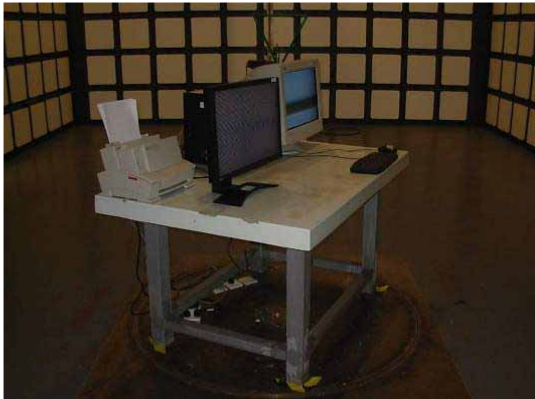
SETUP WITH MAXIMUM DETECTED EMISSION AT VERTICAL POLARIZATION (CRT + HDMI1680*1050@60Hz)