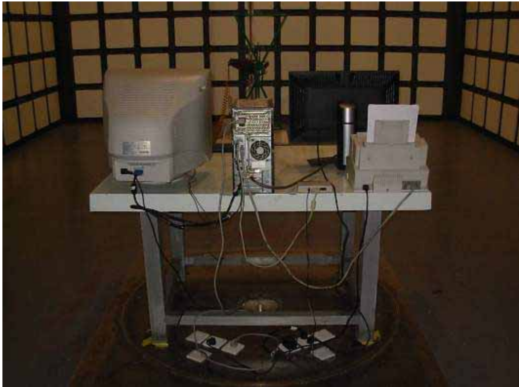
BACK VIEW OF RADIATED EMISSION TEST (BELOW 1GHZ FOR CRT+HDMI)