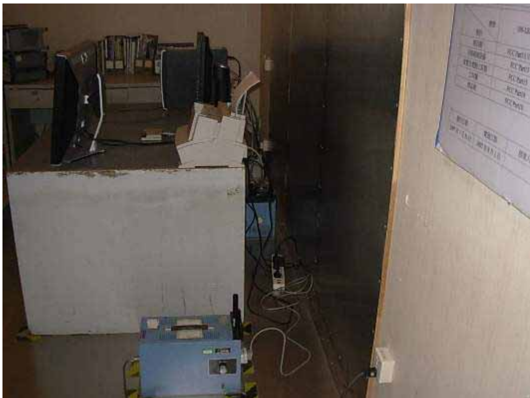
BACK VIEW FOR DVI+HDMI