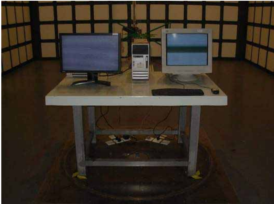
FRONT VIEW OF RADIATED EMISSION TEST (BELOW 1GHZ FOR CRT+HDMI)