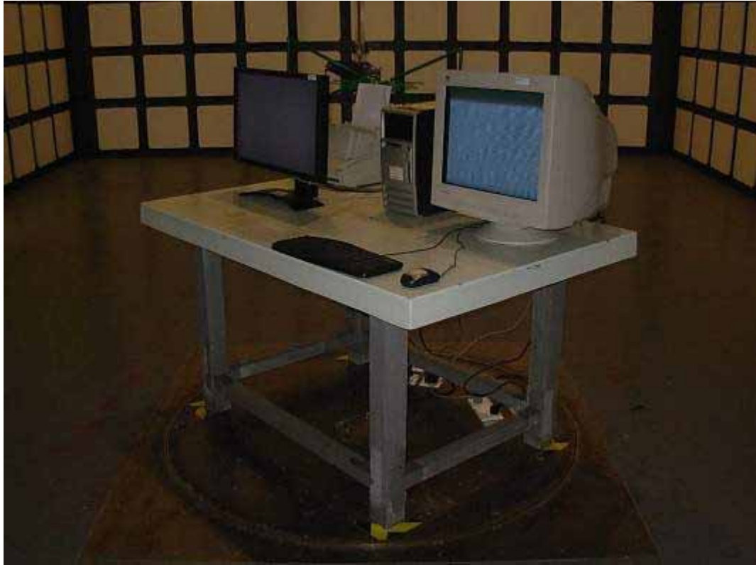
SETUP WITH MAXIMUM DETECTED EMISSION AT HORIZONTAL POLARIZATION (CRT + HDMI1680*1050@60Hz)