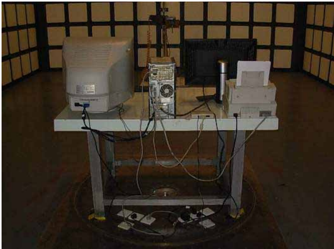
BACK VIEW OF RADIATED EMISSION TEST (ABOVE 1GHZ FOR CRT+HDMI)