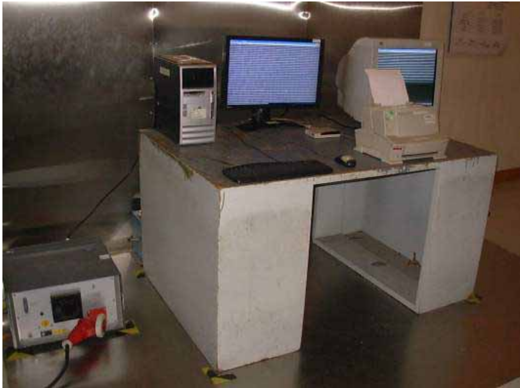
FRONT VIEW FOR CRT+HDMI