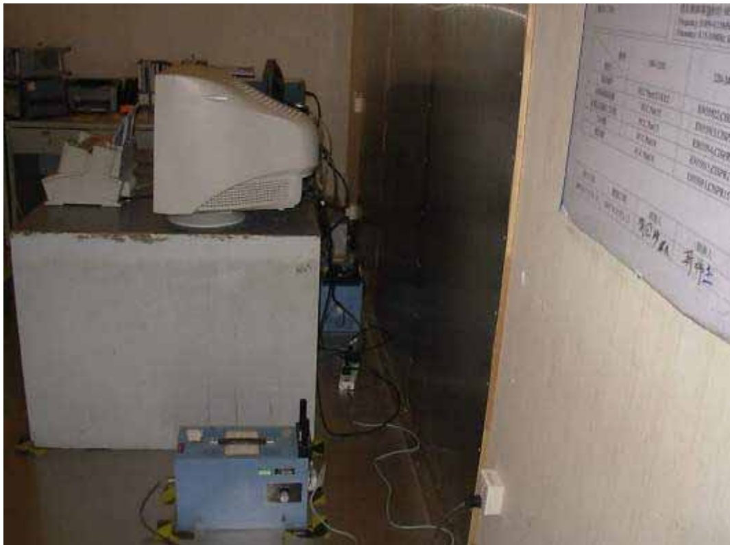
BACK VIEW FOR CRT+HDMI