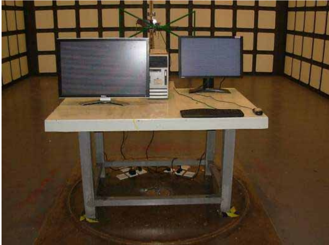
FRONT VIEW OF RADIATED EMISSION TEST (BELOW 1GHZ FOR DVI+HDMI)