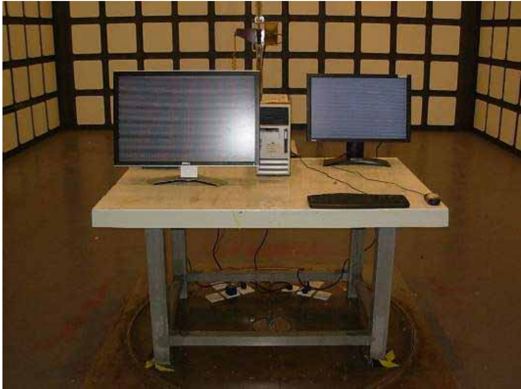
FRONT VIEW OF RADIATED EMISSION TEST (ABOVE 1GHZ FOR DVI+HDMI)