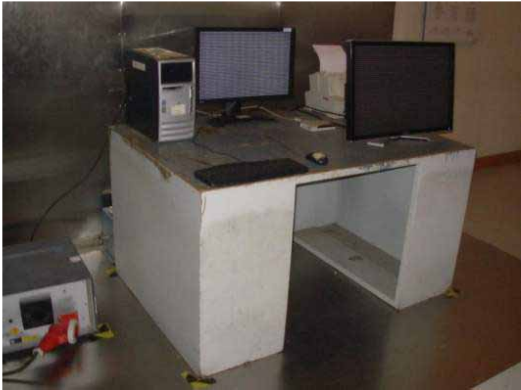
FRONT VIEW FOR DVI+HDMI