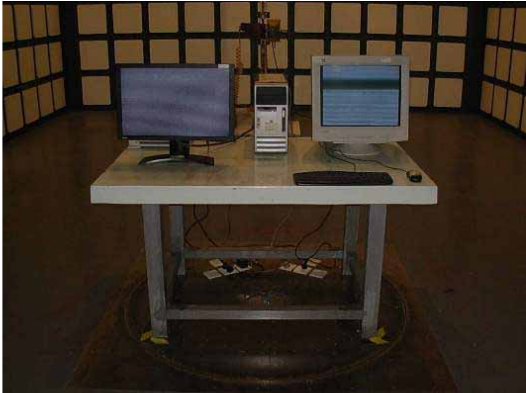
FRONT VIEW OF RADIATED EMISSION TEST (ABOVE 1GHZ FOR CRT+HDMI)