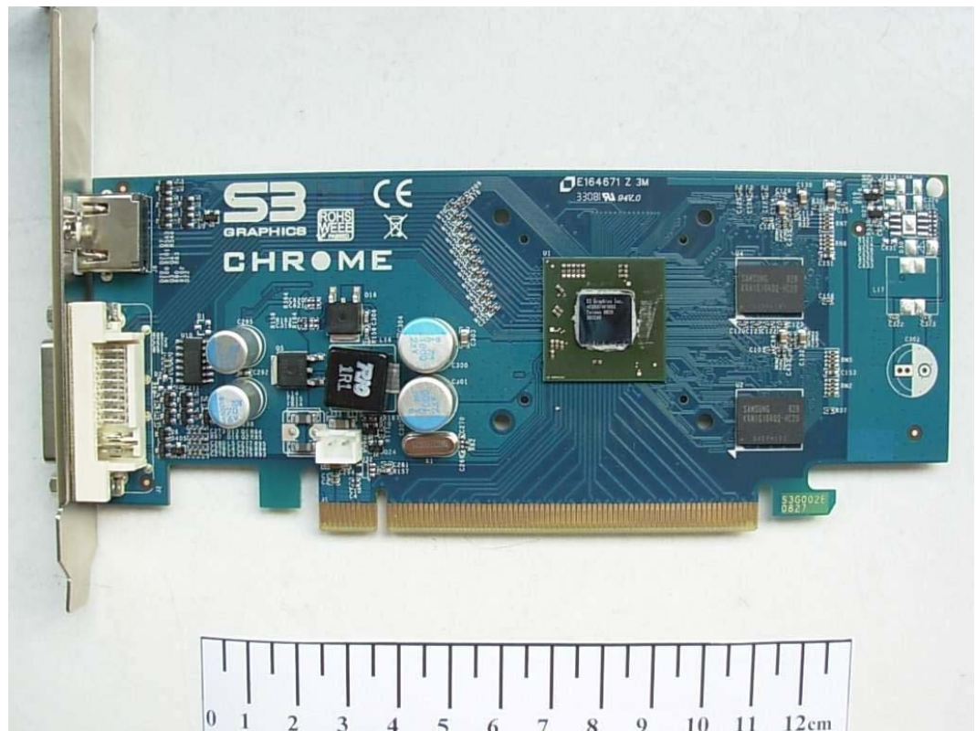
FIGURE 3 CHROME 530 GRAPHIC CARD (M/N: S3G002) MAIN BOARD (SOLDERED SIDE)