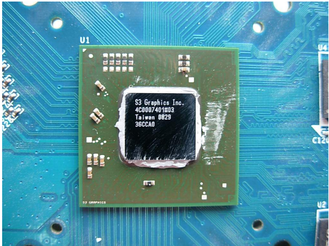
FIGURE 5 CHROME 530 GRAPHIC CARD (M/N: S3G002) CRYSTAL ON MAIN BOARD