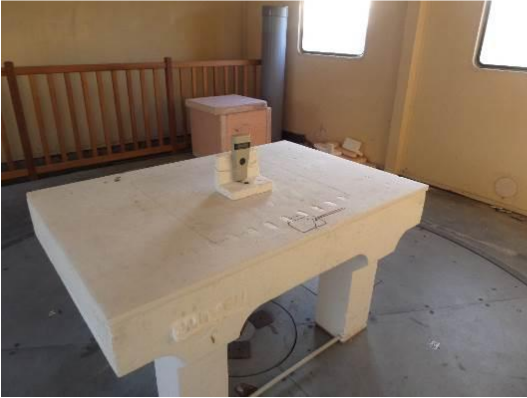
Open Area Test Site – TX mode