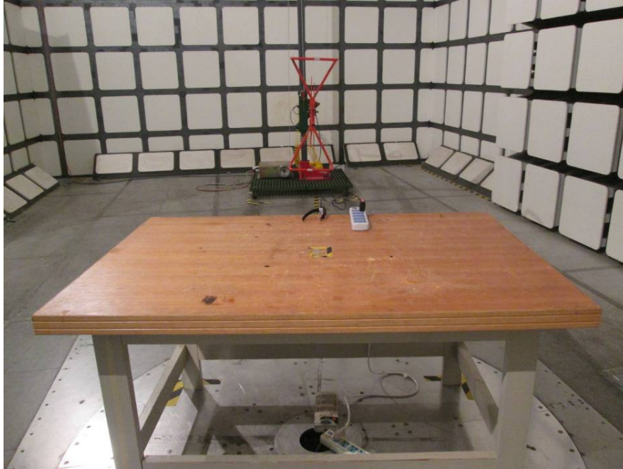
Radiated Emissions – Rear View (30-1000 MHz)