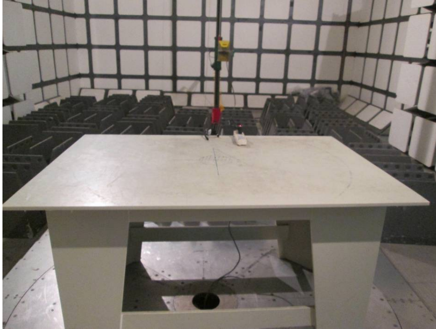
Radiated Emissions – Rear View (1-25 GHz)