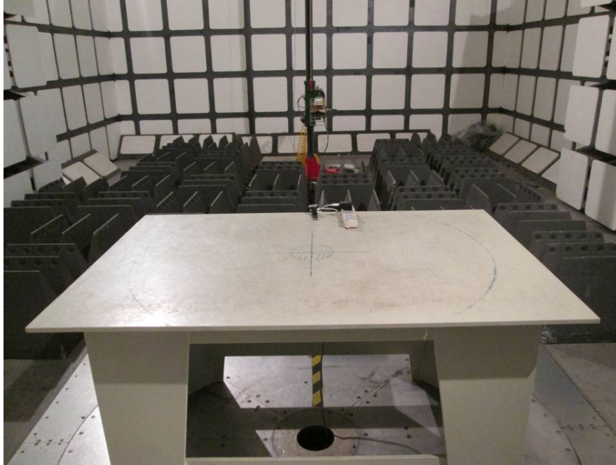
Radiated Emissions – Rear View (1-25 GHz)