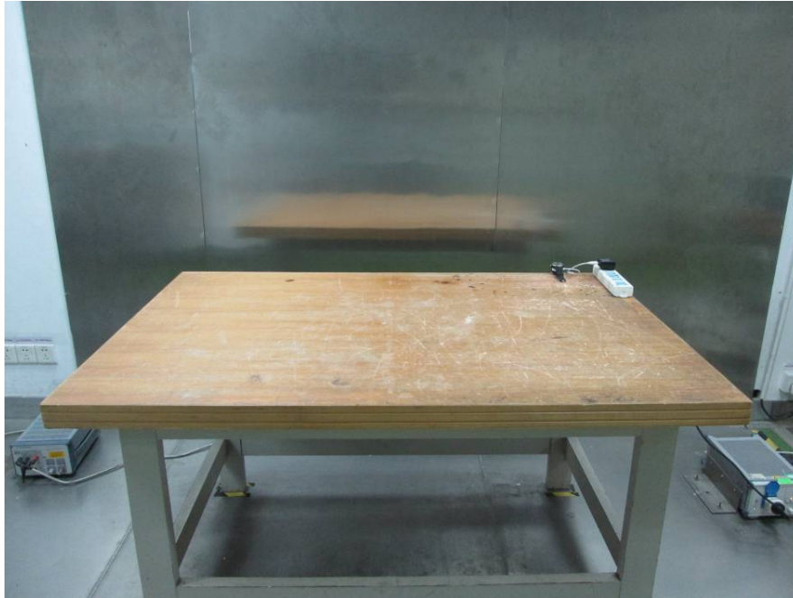
Conducted Emissions - Side View