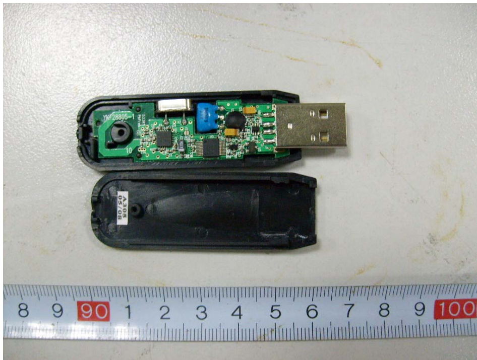
EUT – Main Board Top Components View