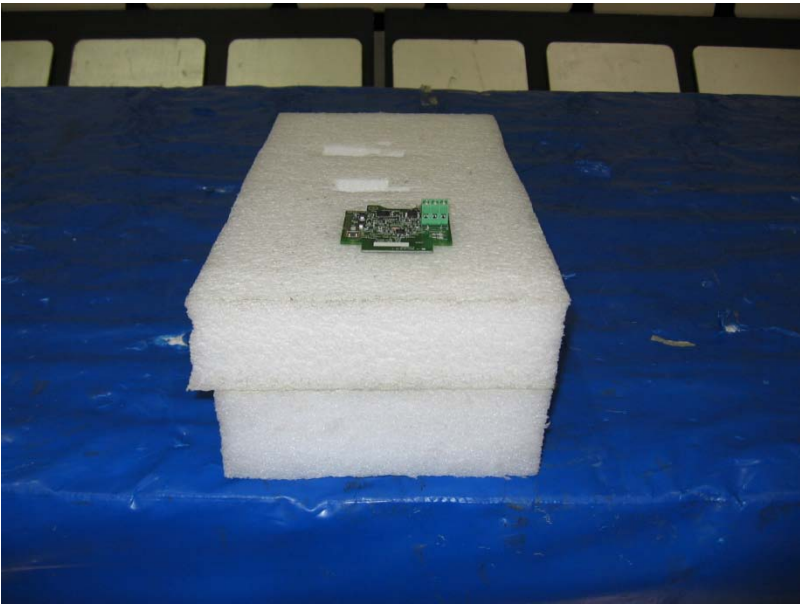
Radiated Emissions – X Axis