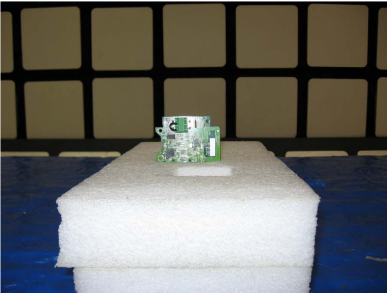
Radiated Emissions – Z Axis