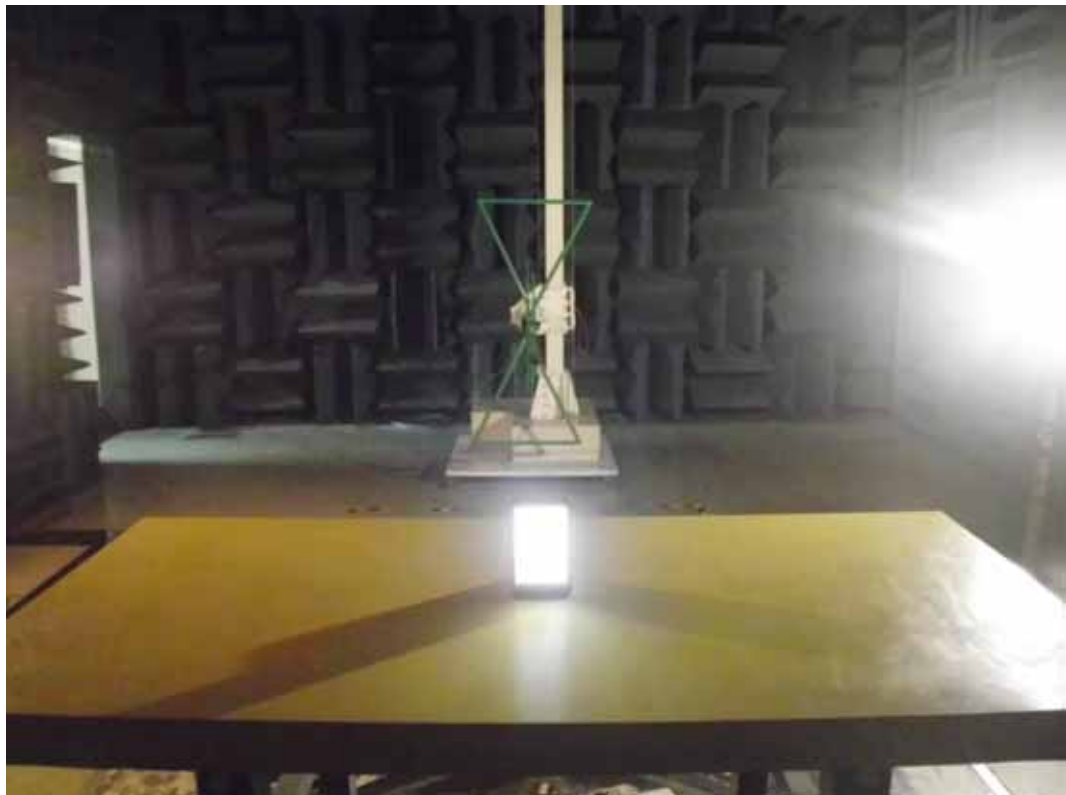
Test Position: Stand