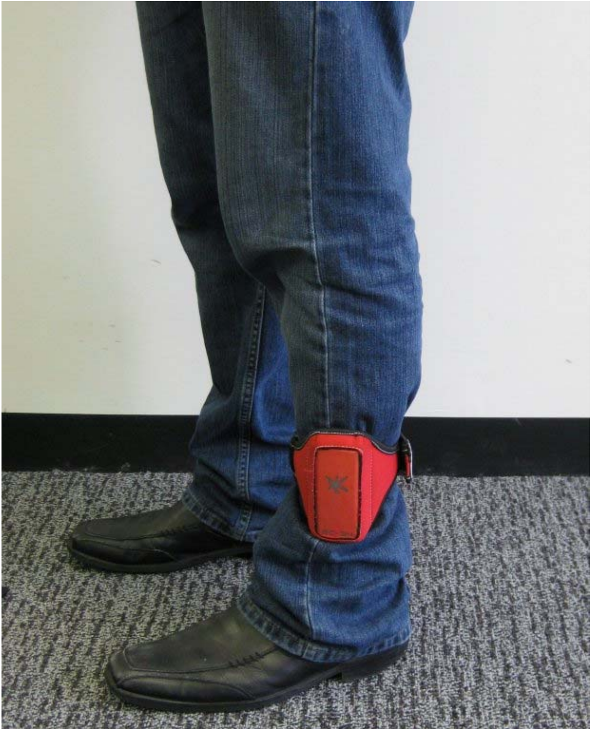
Figure 3 - Position of flaik device when worn on the leg