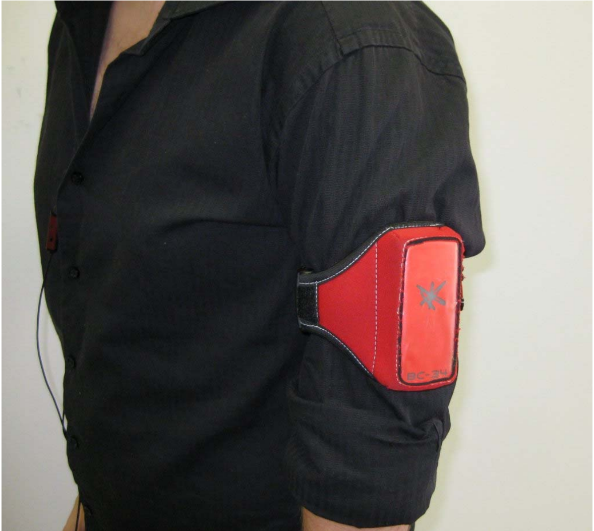
Figure 2 - Position of flaik device when worn on the upper arm

The flaik device is only to be operated when worn on the upper arm (see Figure 1) or the lower leg (see Figure 3). The flaik device should always be worn in the supplied neoprene armband.