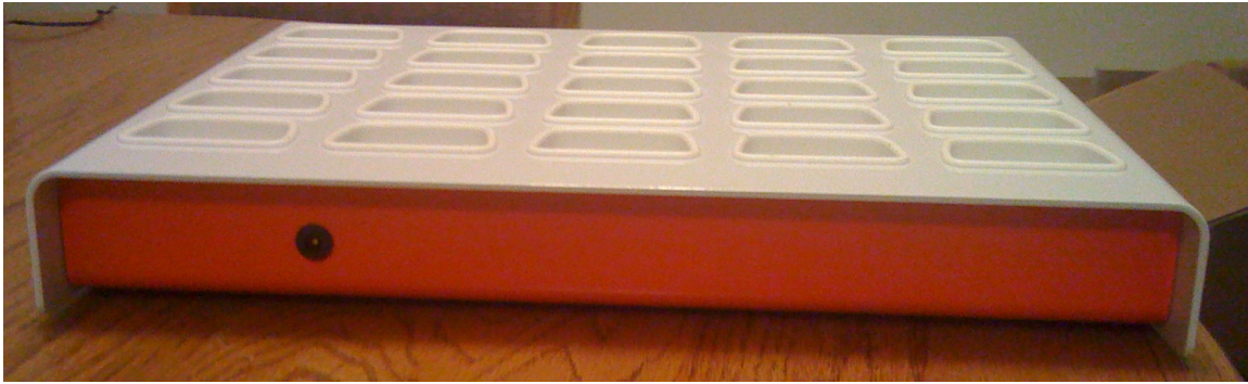
Figure 5: Rear View showing the DC connection from the TR45A05.