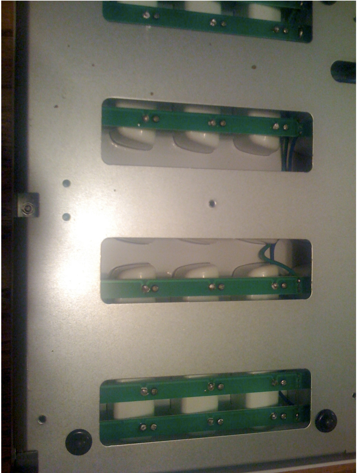
Figure 3: Internal View