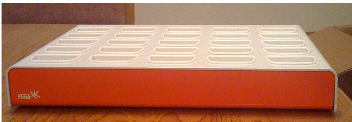
Figure 2: Front View