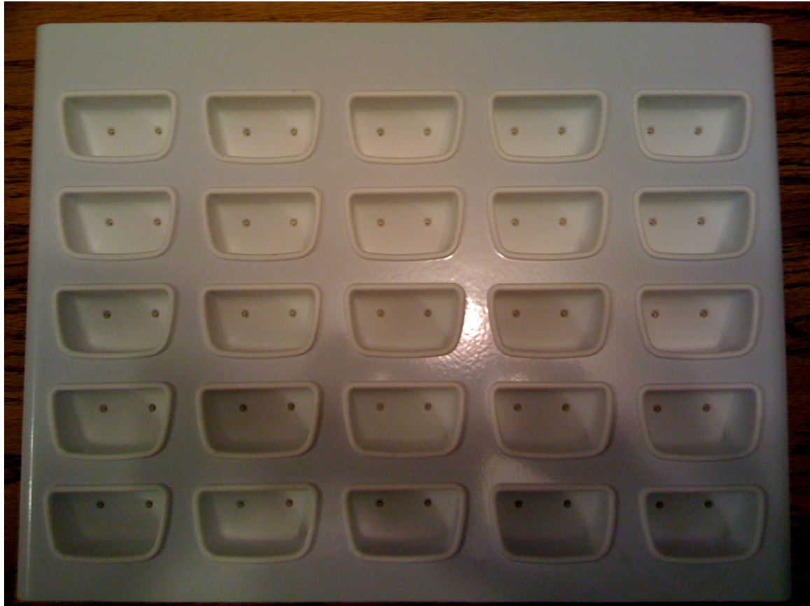
Figure 1: Top View