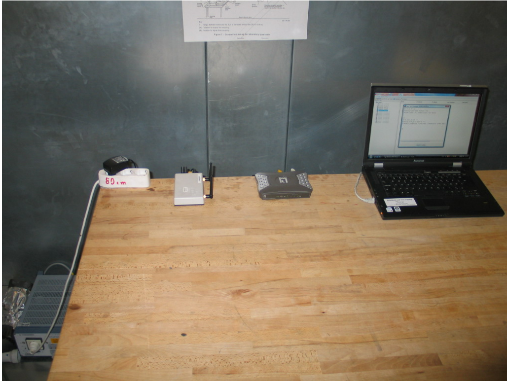
Photo 4: Test setup for conducted measurements (AC Port (power line))