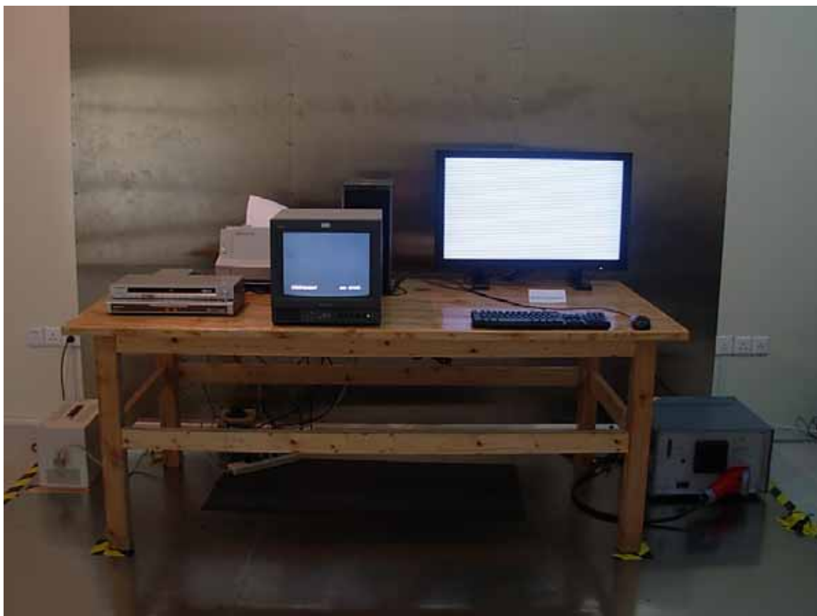
Front View of Conducted Emission Measurement (H Pattern)