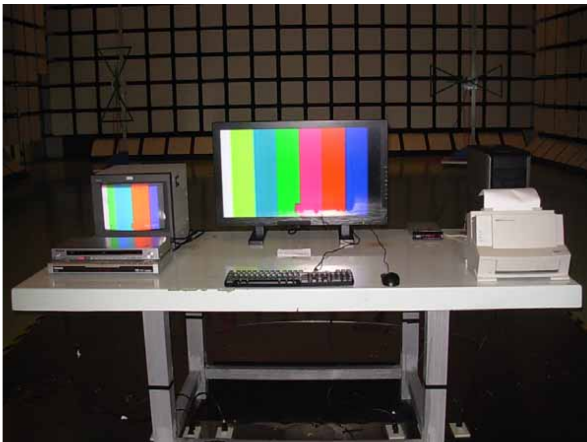
Front View of Radiated Emission Measurement (Colorbar)