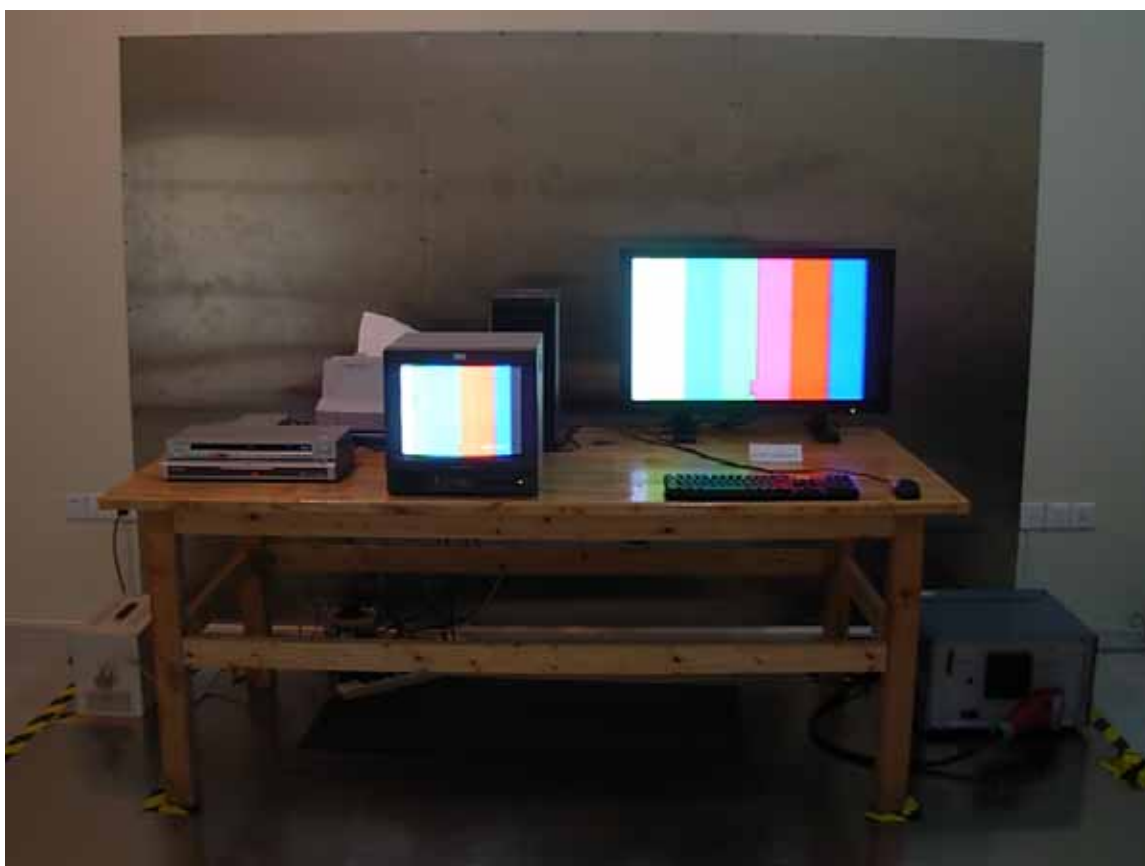
Front View of Conducted Emission Measurement (Colorbar)