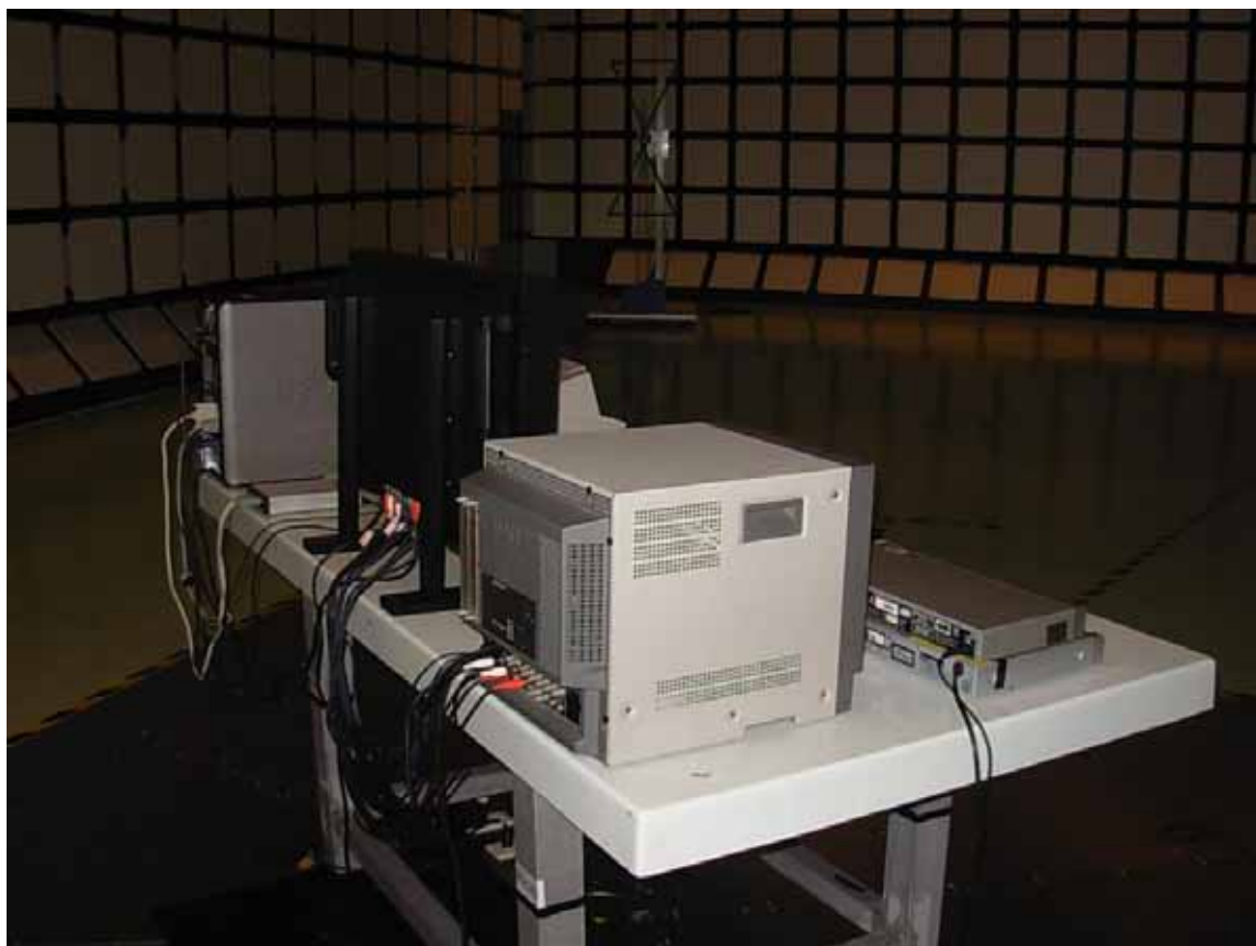
Setup with Maximum Detected Emission at Vertical Polarization