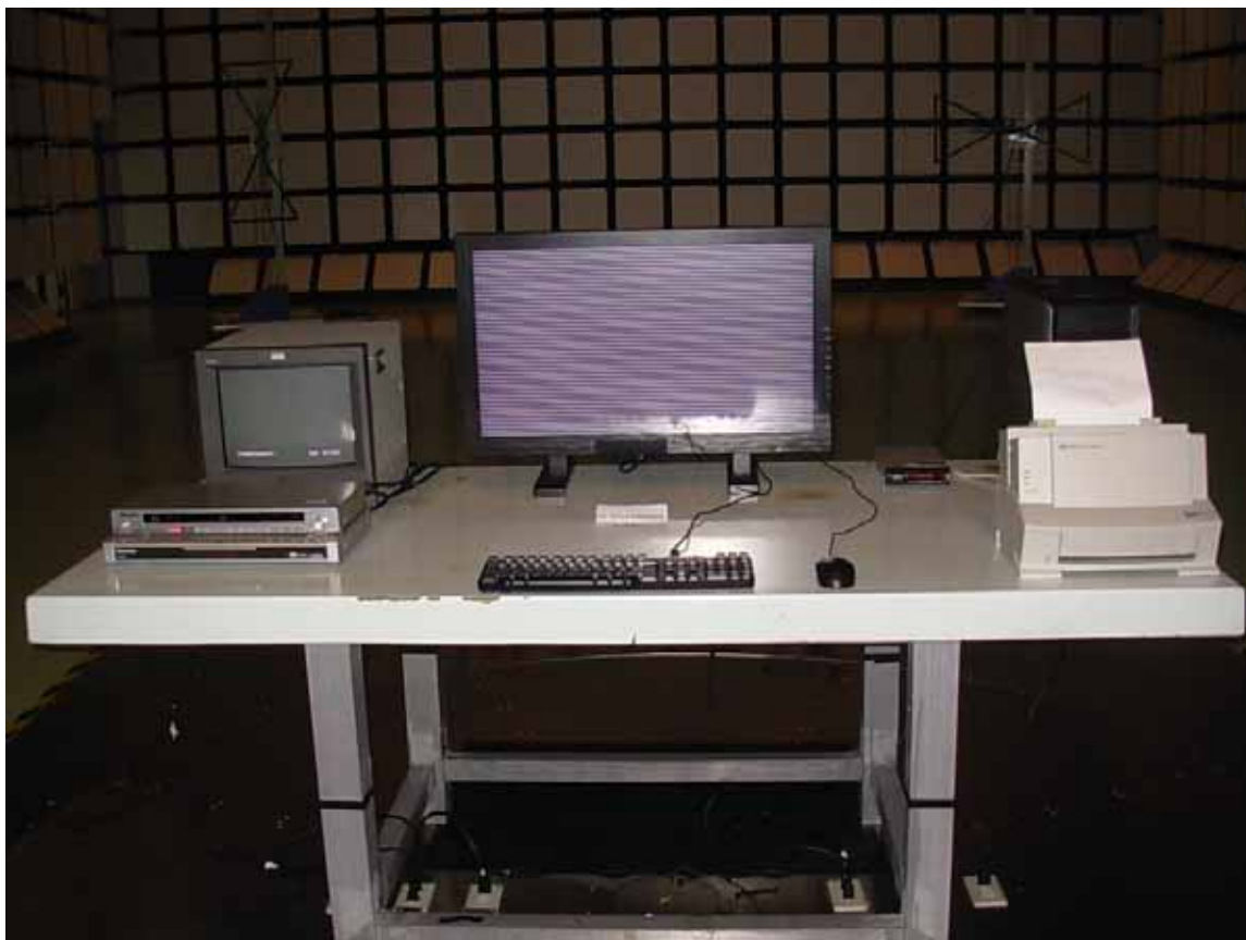
Front View of Radiated Emission Measurement (H Pattern)