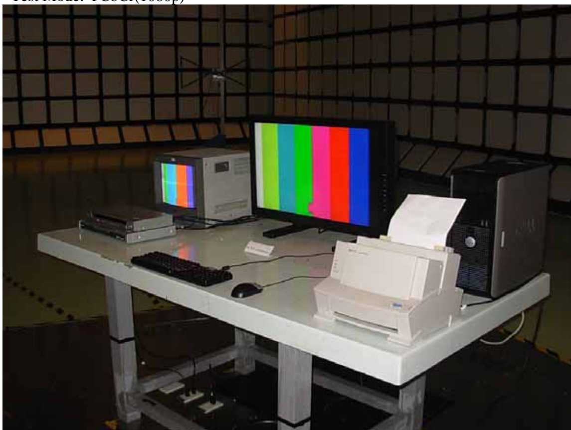
Setup with Maximum Detected Emission at Horizontal Polarization