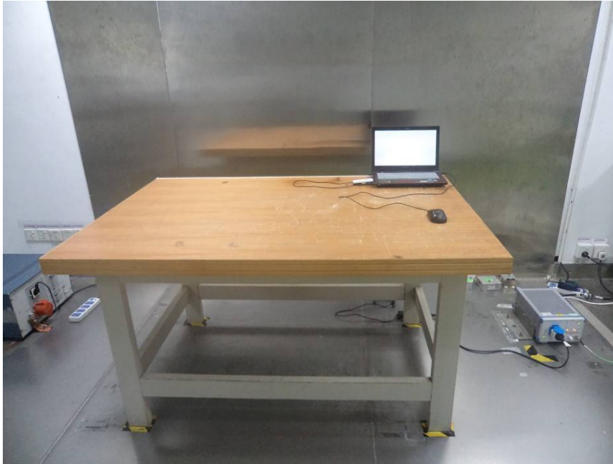
Conduction Emissions - Side View