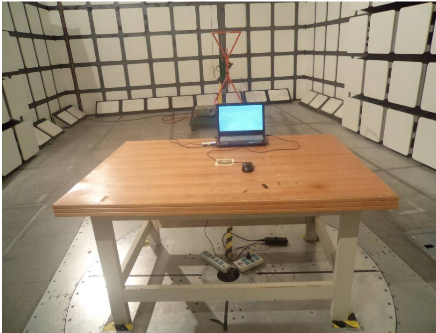
Radiated Emissions – Rear View (30-1000 MHz)