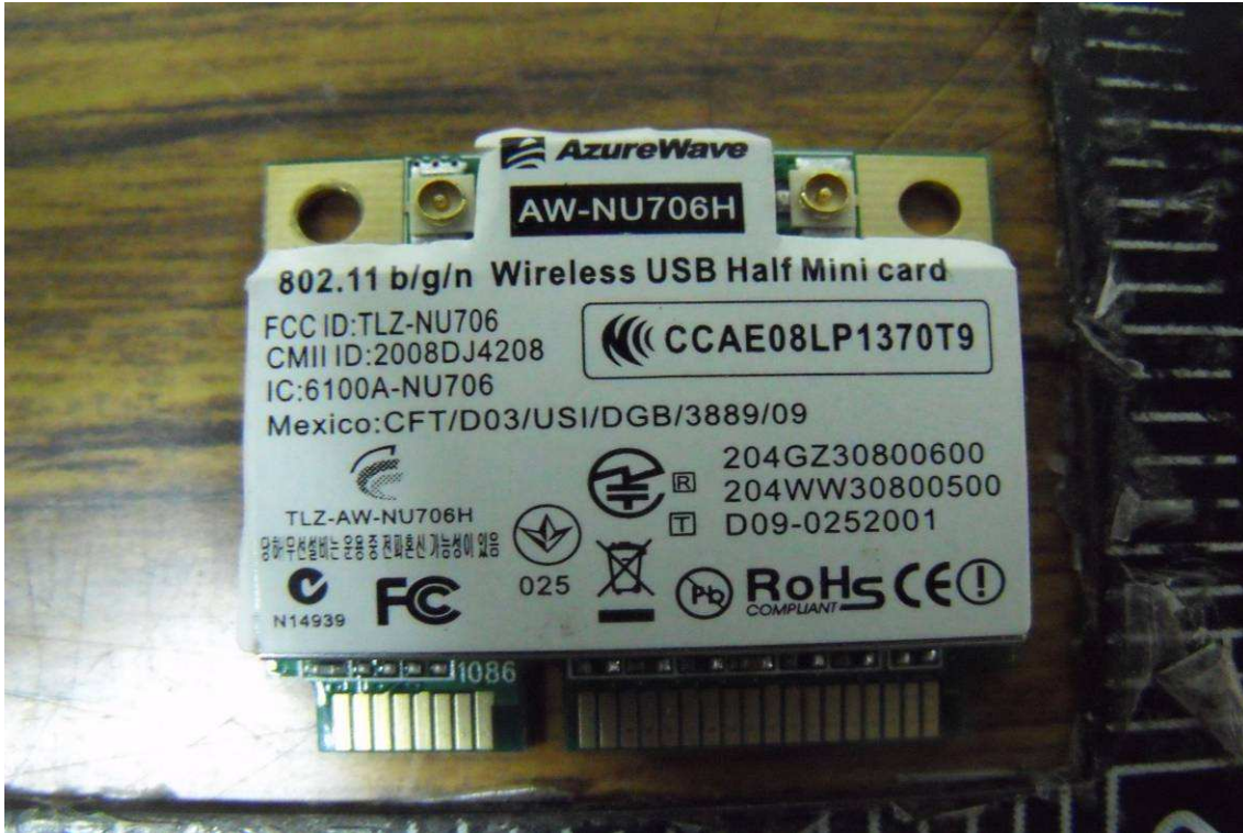
Appreance view of EUT