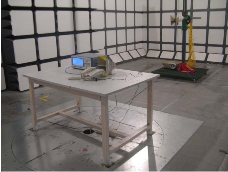
Radiated Emissions - Rear View ((Above 1 GHz)