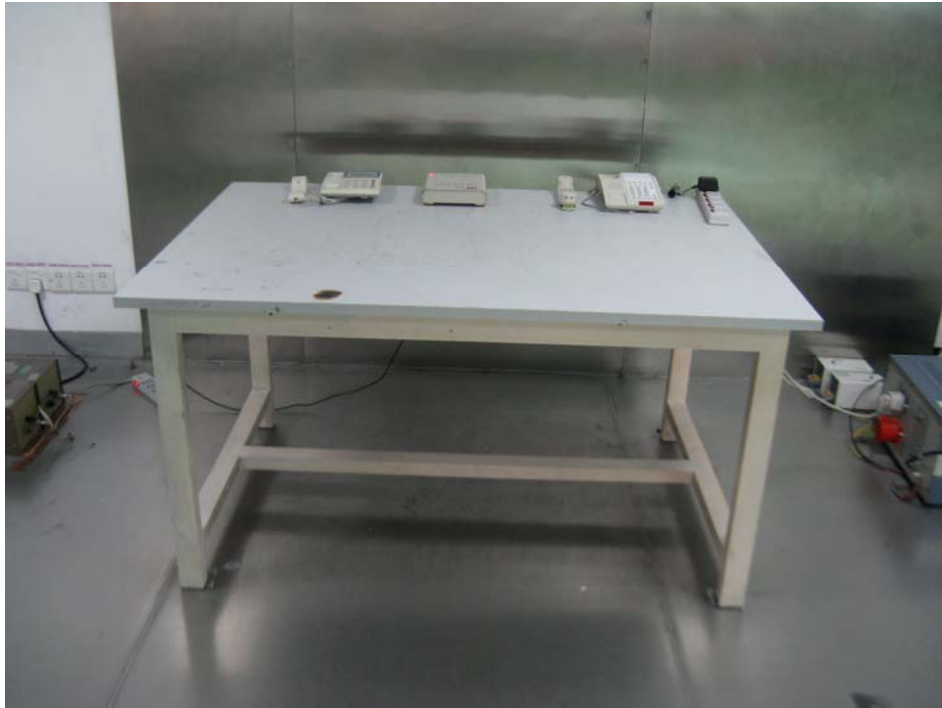
Conducted Emissions -Side View