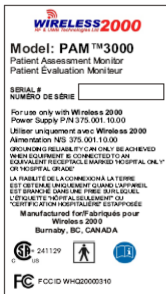
Fig. 1 PAM 3000 Label