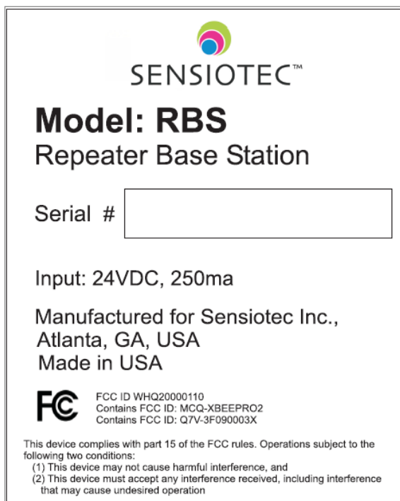
Fig. 1 RBS Label