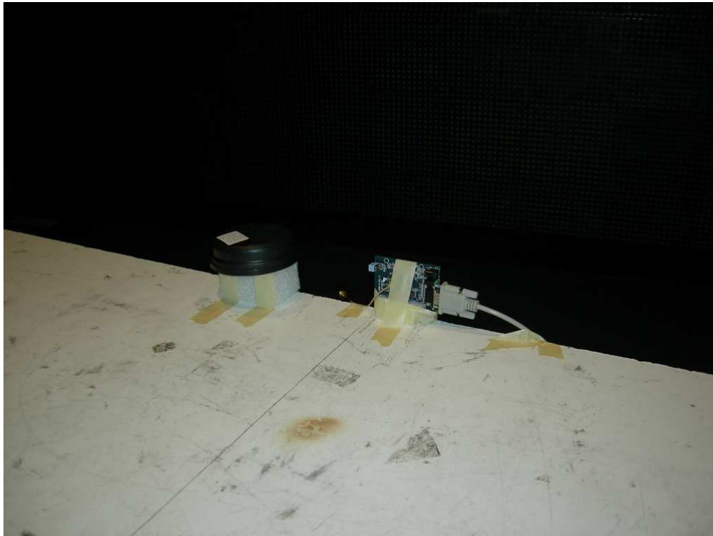
Figure 3: Radiated Emissions – YPOS