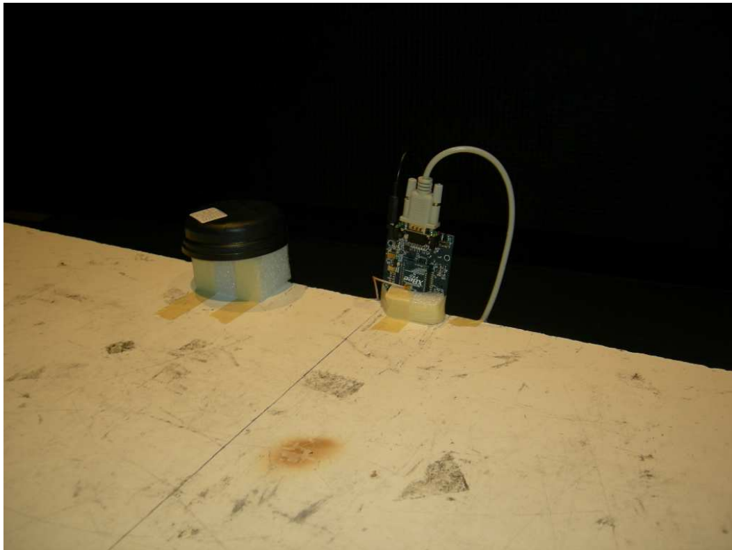
Figure 5: Radiated Emissions – ZPOS