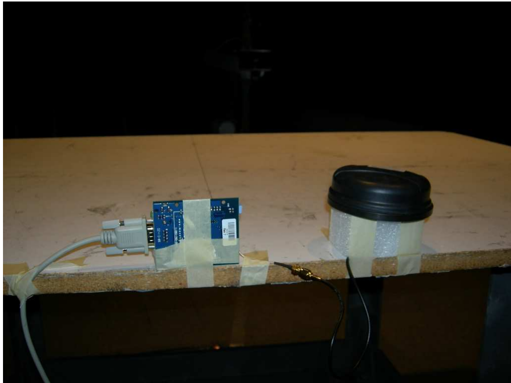
Figure 4: Radiated Emissions – YPOS