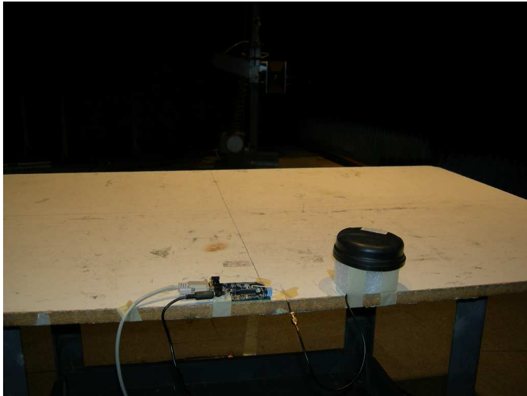
Figure 2: Radiated Emissions – XPOS