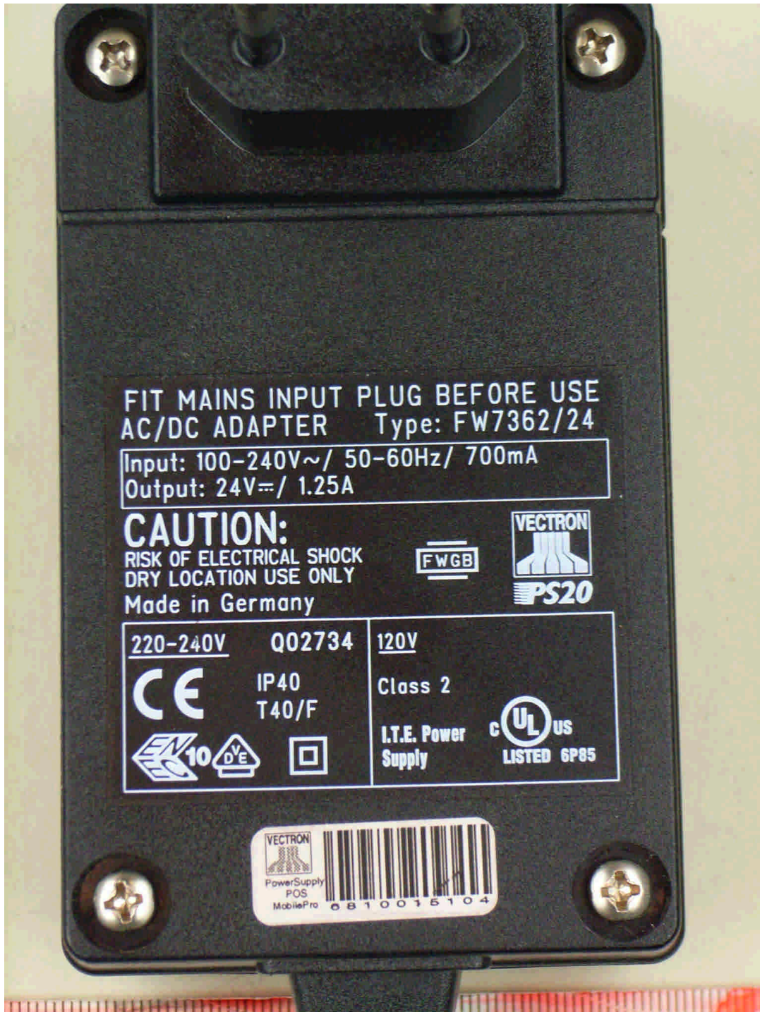
80804_h2.jpg FW7362 / 24, type plate view

Annex B of test report F080804E02 EUT: POS MobilePro Manufacturer: Vectron System AG