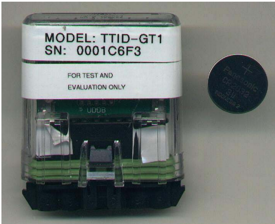
Figure 1: TTTX Transmitter