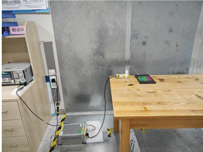
Radiated Emissions From 30M-1GHz