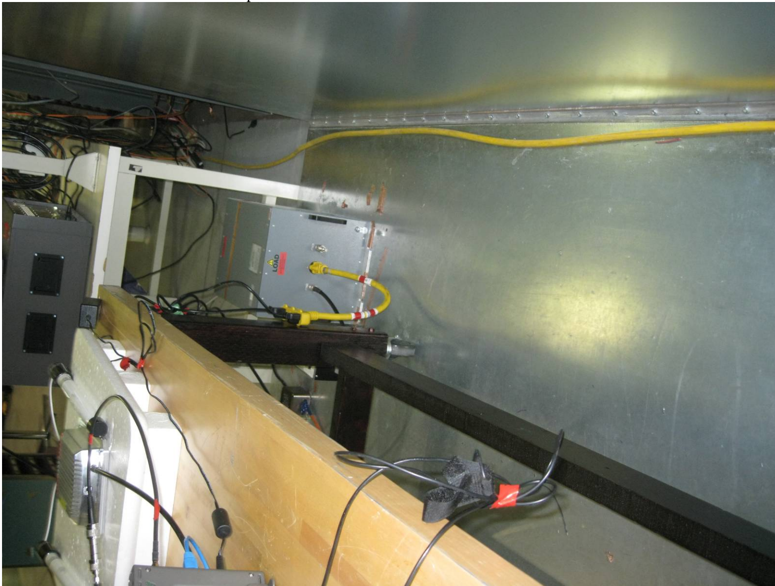
Power line conducted Emissions Setup Photo 1

180 Brodie Drive, Unit #2, Richmond Hill, ON, L4B-3K8 Tel: (905) 883-3919, Fax: (905) 883-7995