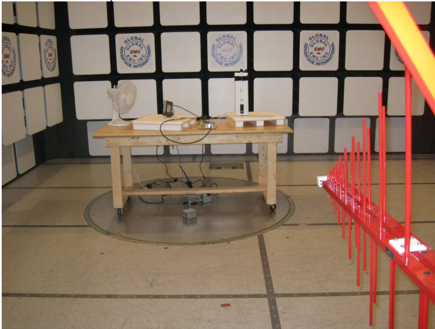
Radiated Emissions Test Setup 30MHz – 1 GHz