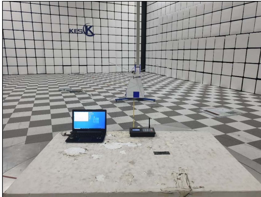
Radiated field emissions