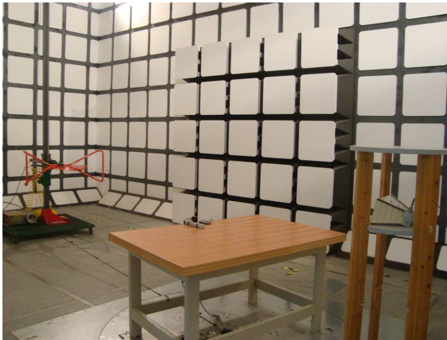
Below 1GHz: Radiated Emissions - Rear View