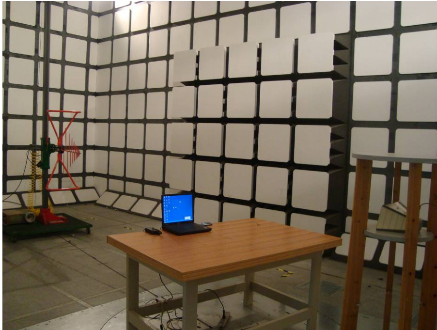
Below 1GHz: Radiated Emissions - Rear View