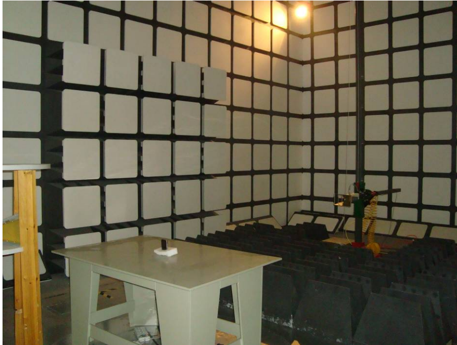
Above 1GHz: Radiated Emissions - Rear View