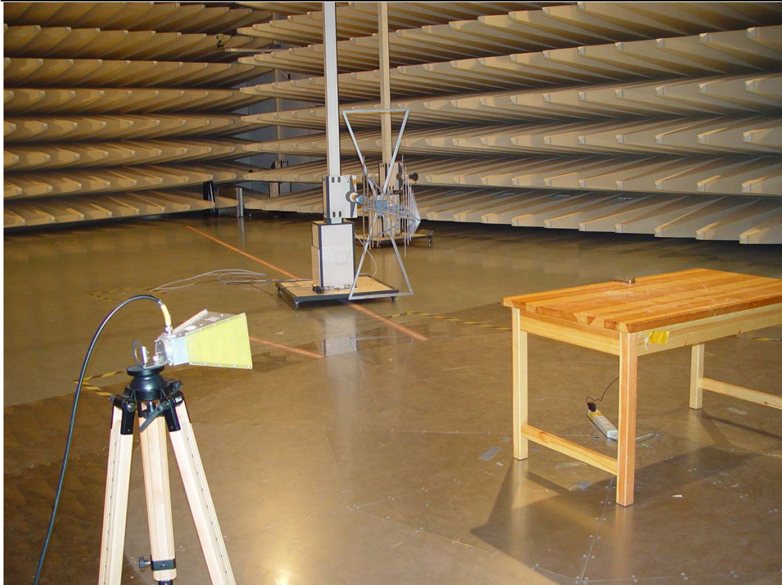
Pic 3 Radiated Emissions Test Setup