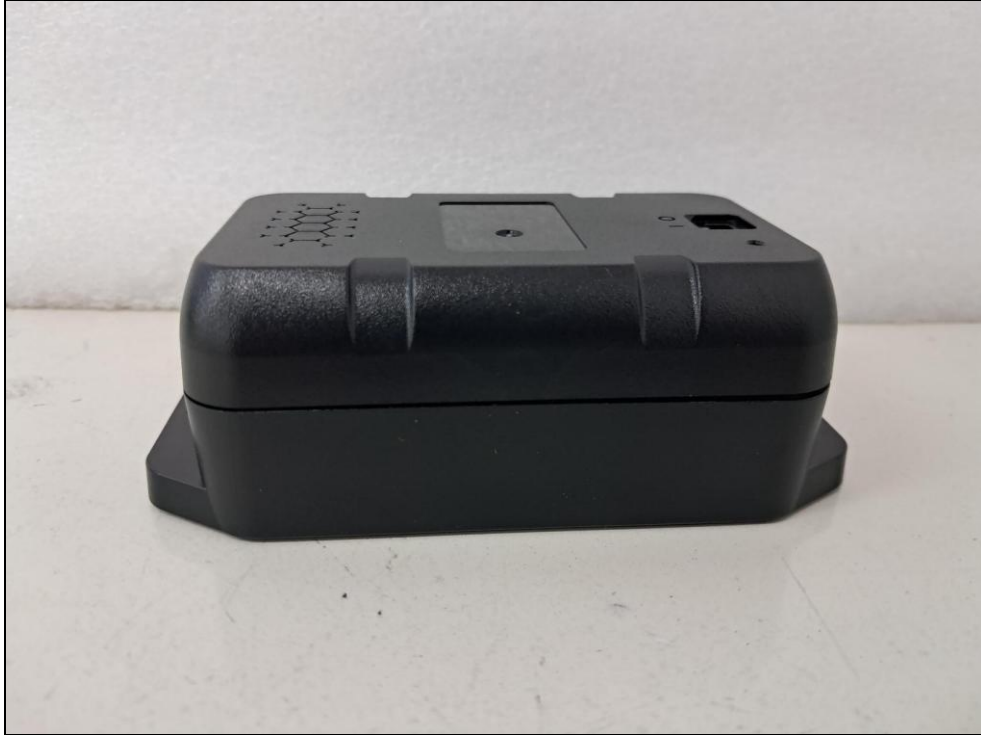
Side view of EUT