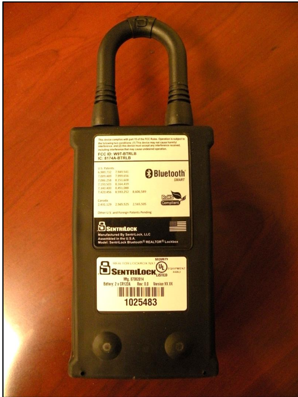
Photograph 5: Back