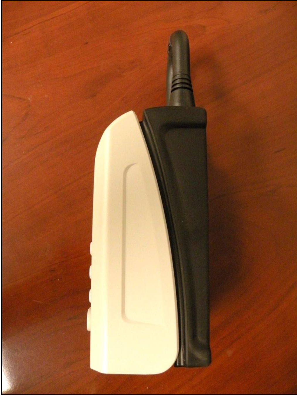
Photograph 6: Side