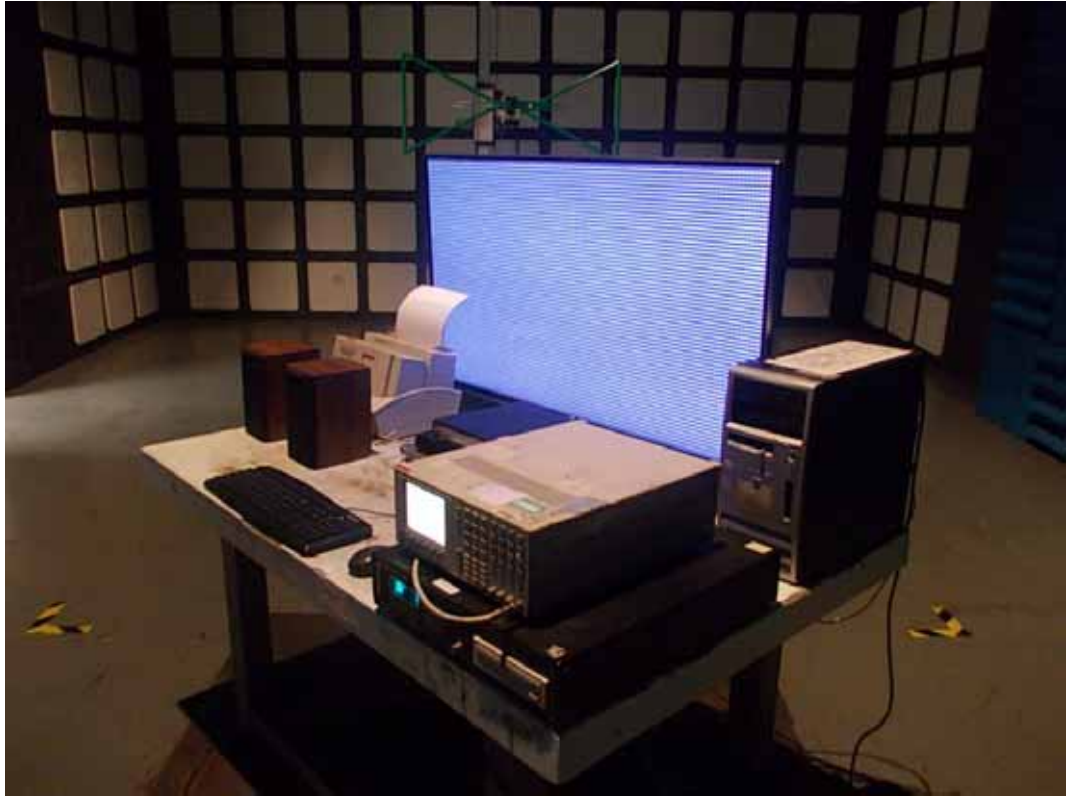
SETUP WITH MAXIMUM DETECTED EMISSION AT HORIZONTAL POLARIZATION (TEST MODE: D-SUB 1024*768@60Hz)