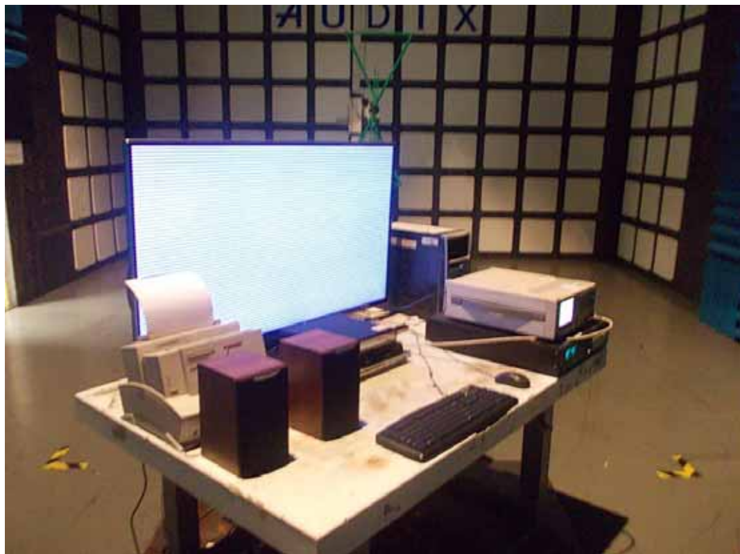
SETUP WITH MAXIMUM DETECTED EMISSION AT VERTICAL POLARIZATION (TEST MODE: D-SUB 1024*768@60Hz)