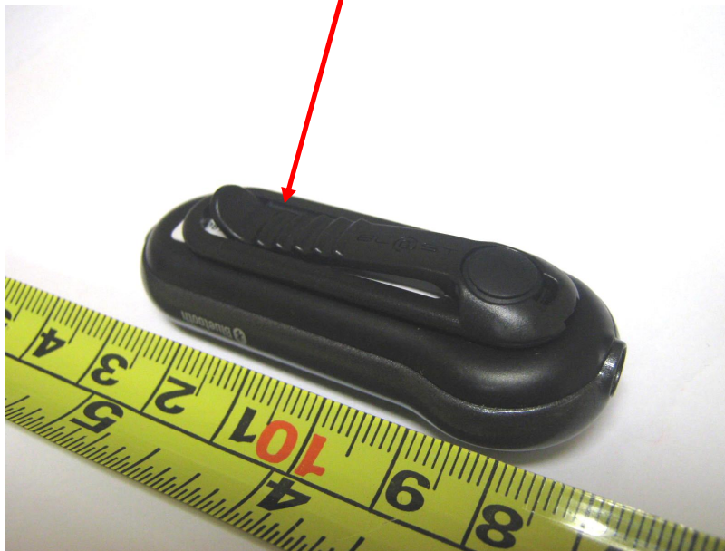
Physical Location of FCC Label on EUT