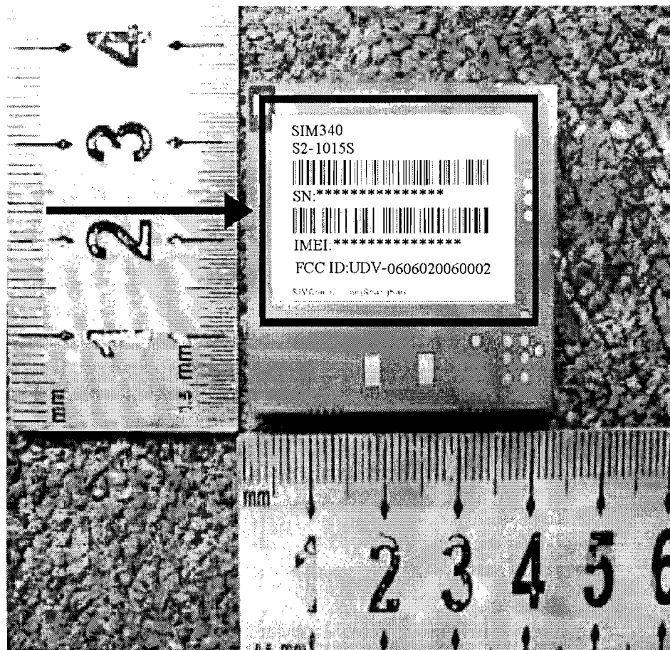
RF module bottom view