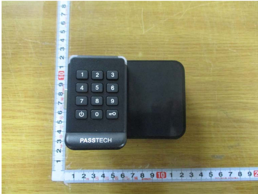
Multi-model : ZP100WR